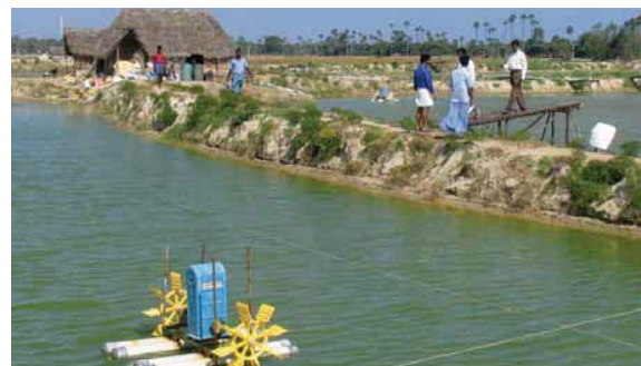
To meet certification requirements, one way forward may be to promote the certification of clusters of small-scale farmers, as has been done in other agriculture sectors.

The need to respond to social, environmental and consumer concerns regarding