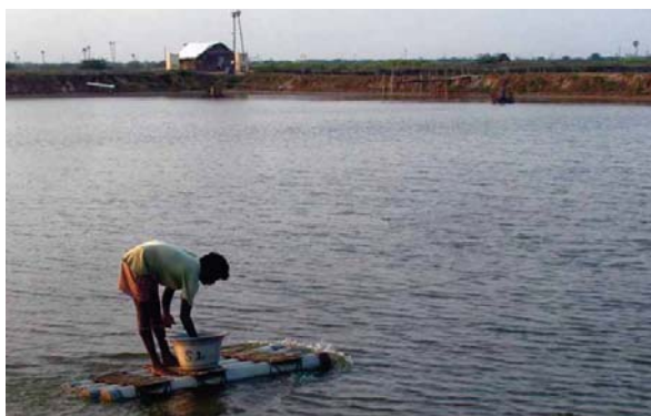
The thousands of small-scale farm operations provide important economic and social benefits, but face challenges in reaching wider markets.