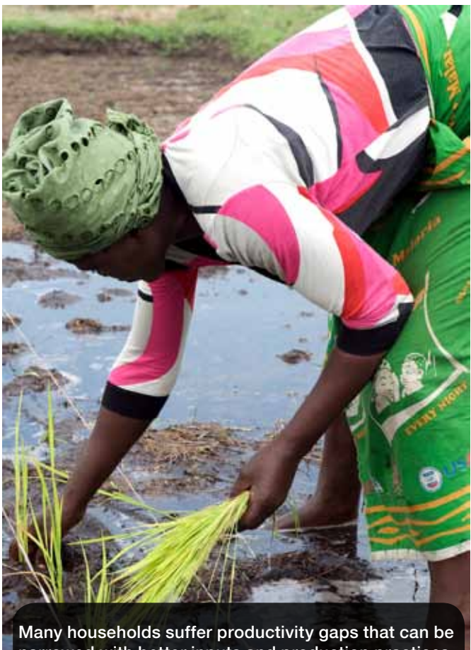
Many households suffer productivity gaps that can be narrowed with better inputs and production practices.

be identified through stakeholder engagement. However initial discussions in each country have identified six broad constraints that perpetuate poverty and vulnerability in aquatic agricultural systems.