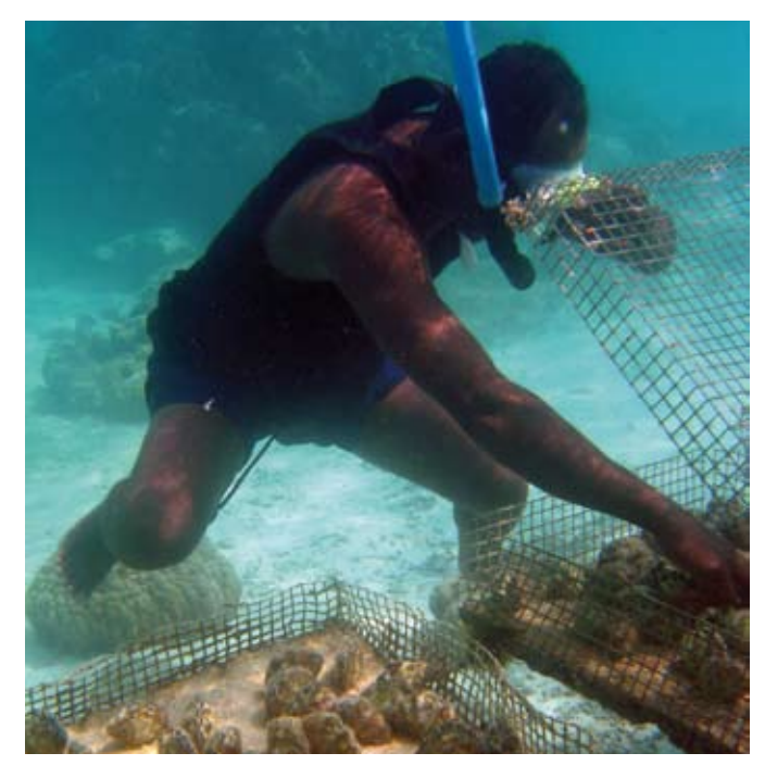
Giant clams in grow-out phase at one of the farms

Lessons learned through this five year project are discussed in relation to the cumulative wisdom of other livelihood interventions on the basis of the three main components of the project: Initiation, Implementation and Extension and Exit Strategy. Each of these are explored for aspects pertaining to the project participants; the product itself and the underlying processes that WorldFish and WWF-SI undertook for the duration of the project.