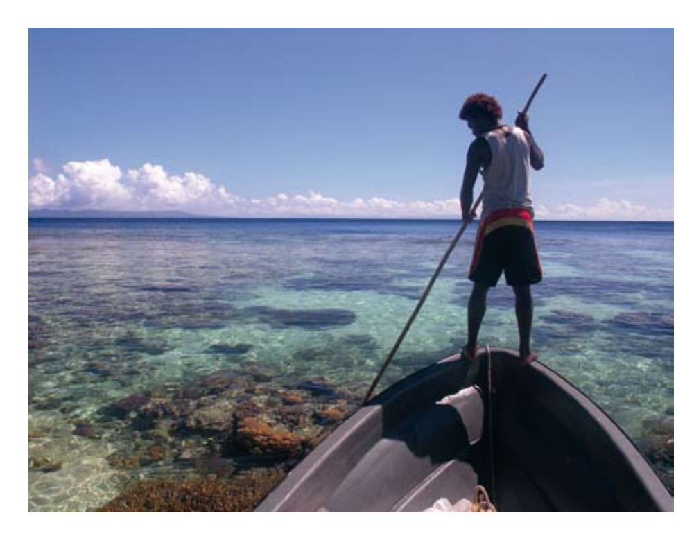
Environmentally-friendly supplementary livelihoods can provide a source of income, improved human well-being and resource management outcomes

The privately operated depot was established through an application based process within the existing farmer network. Although there was initial farmer jealousy towards the operators who were awarded the depot role, the depot model has proved successful to date. Crucially, the depot requires operators with the aptitude and ability to communicate effectively with the exporter for product sales.