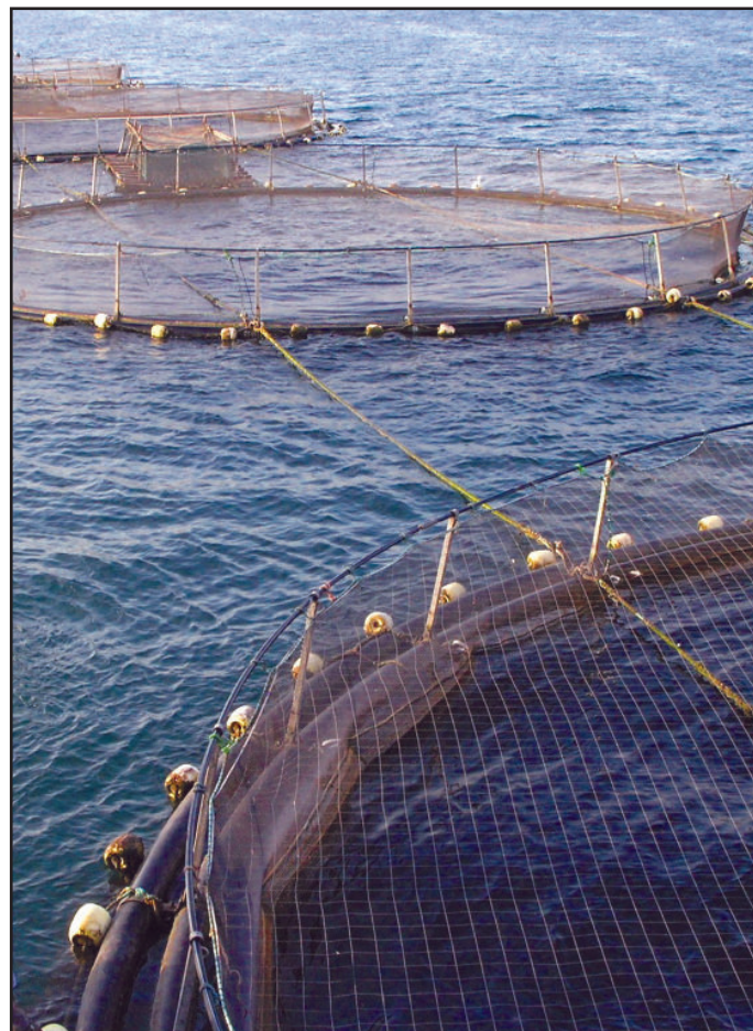
Fish net cages in Malawi; aquaculture production for local food security