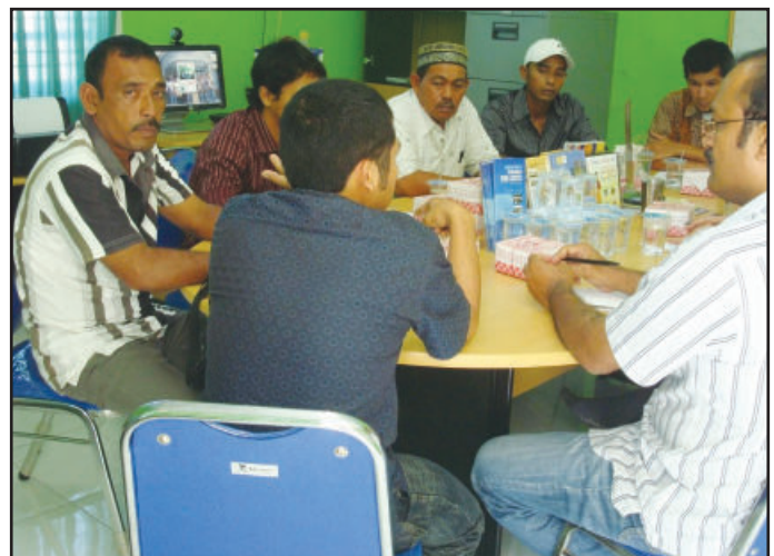
Members of an Aquaculture Livelihood Service Centre in Aceh engaged in discussion about their business plan

With respect to the private sector, it was found that medium-sized companies and multinationals from the North partnered with farmer cooperatives 49% of the time, with smallholders 38% (mostly involved within a wider group of private partners), aquaculture and fisheries associations 26%, and with community groups 19%. (The total exceeds 100% because there is often a mixture of private partners involved). This indicates that although there was strong representation from smallholders in the development partnerships, overall there was a preference for social groups such as cooperatives, associations and communities (94%). This reflects the desire for partnerships of economic scale. There is an understandable need to minimize the risk of failure of development projects. The public authorities want to achieve sustainability and multiplication of the benefits beyond the project’s duration and the private profit-oriented enterprises from developed countries will only invest when adequate returns on investment may be expected; hence they tend to work with larger producers or aggregated producers (cooperatives and associations). A requirement for the integrated partner to be of a certain economic scale was