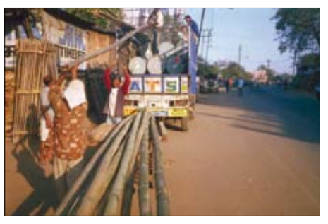
Figure 2. Cage materials