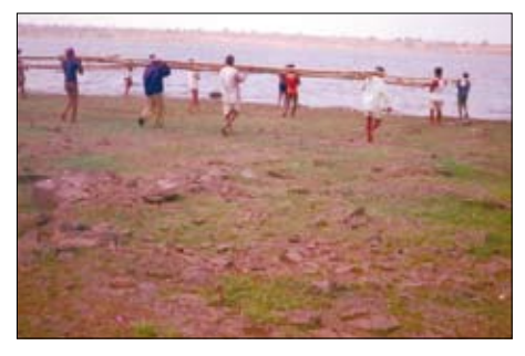
Figure 6. Installation of frame

Four poles are used to make one long side of the rectangle. Two poles are placed on the ground with their tip portions overlapping to make their combined length at least 14.5 metres. Six such lengths are made for the two long sides and the central divider. Each long side and the central divider consists of two such 14.5-metre lengths placed parallel 35 cm apart.