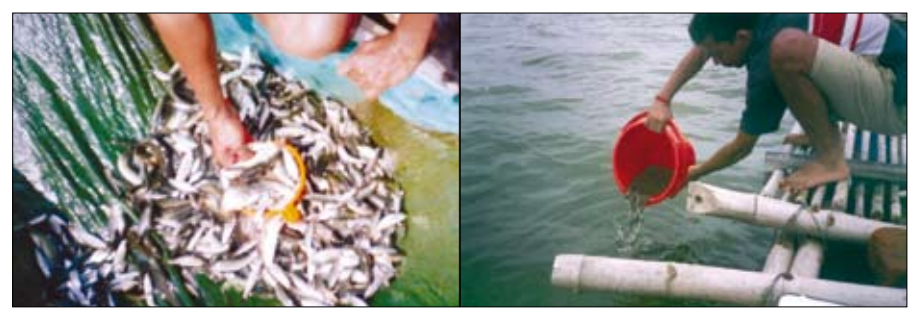
Figure 19. Release of fish fingerlings