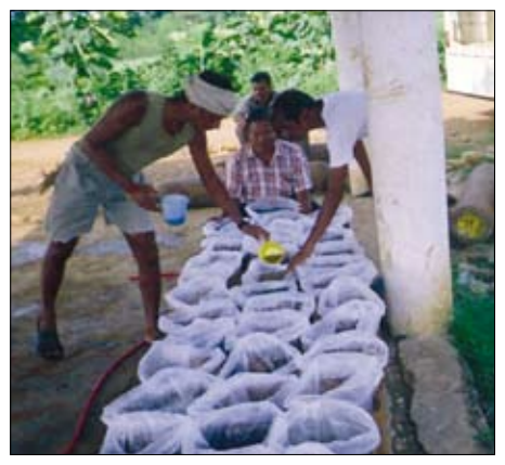
Figure 11. Oxygen packing of fish seeds

For raising fingerlings in cages in Indian reservoirs, healthy carp fry measuring 12-15 mm long, or even up to 25 mm, are best suited. Advanced fry longer than 35 mm