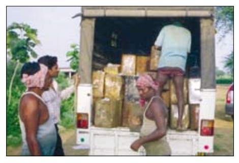
Figure 12. Transporting of fish seeds

conditioning at the site of procurement and acclimatization at the site of release in cages. Conditioning is required to transport the fry with empty stomachs, as the ammonia and carbon dioxide generated by fish waste may prove lethal to fry during transport. Fry acclimatization is essential at the site of release in cages to ensure a balanced environment, especially in terms of temperature. The oxygen packets transported with the fry (1,000 fry in 4 litres of water in a polythene packet 2/3 filled with oxygen) are kept inside cages for at least an hour before the fry are released. Prior to release, fry are subjected to some prophylactic measures to protect them from diseases and ecoto-parasites. They are dipped in a 5-6% salt solution as well as potassium permanganate (5-8%) for 1 to 2 minutes and then released into the cage water.