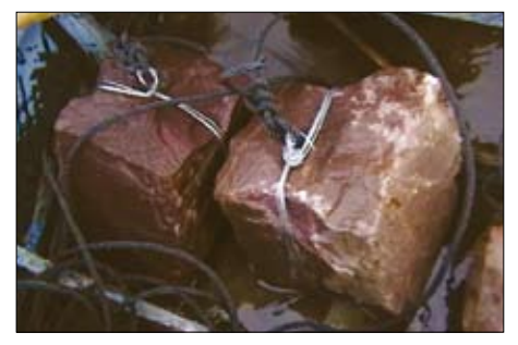
Figure 4. Netlon cages