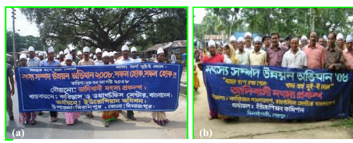
Picture 3: Project participants of AFP are in the Fish Week Rally- 2008 (a) Birampur Upazilla of Dinajpur (b) Jhinaigati Upazilla of Sherpur distict

The farmers' 'rally' is one important tool used in technology dissemination and informing a wider community about the success of the program. The project is encouraging the project beneficiaries to participate in the national program such as fish week, agricultural fair etc. Due to the project initiative huge number of Adivasi households attended the fish week program such as rally and meeting in 2008. The participation of Adivasi Fisheries Project (AFP) beneficiaries was highly appreciated by the upazilla administration.