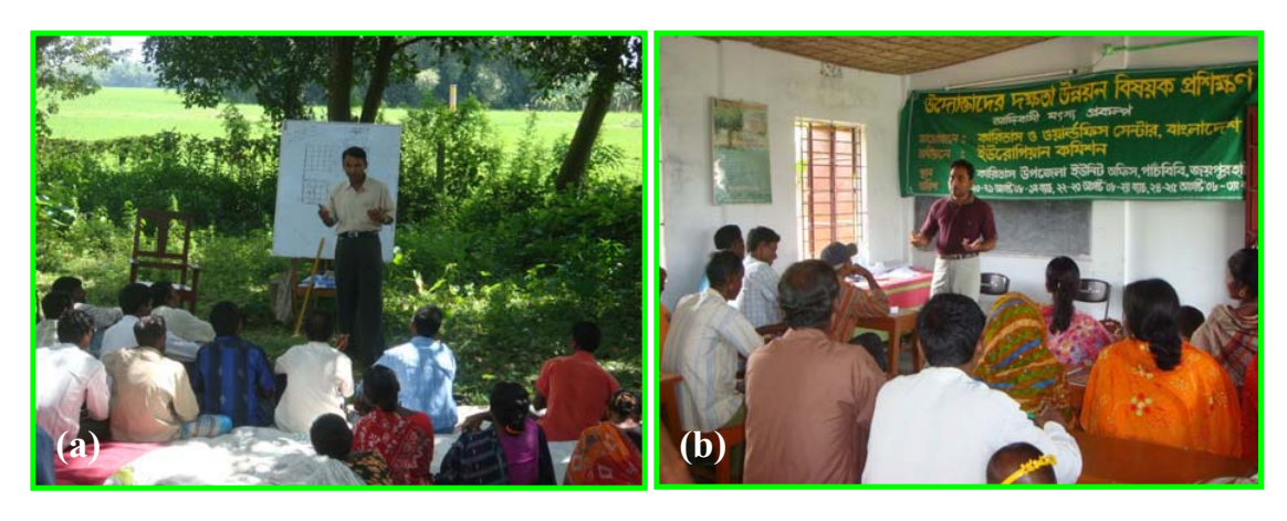
Picture 1: Capacity building training of the LEs (a) Upazilla Fisheries Officer of Birgonj (b) WorldFish staff is playing the facilitating role in the training

The Adivasi Fisheries Project is using the Farmer Field School (FFS) approach as a tool for effective dissemination of the knowledge on aquaculture technologies and other aquaculture related activities to the project beneficiaries. The AFP formed 120 FFS in the project area in July 2007. A total of 3202 FFS sessions were organized in 2008 against the set target of 2800 FFS sessions (2 FFS session per month per FFS). A total of 402 additional sessions was organized based on the immediate need of the beneficiaries. The schedule of the FFS sessions was developed through a participatory discussion with the project participants at the beginning of the year.