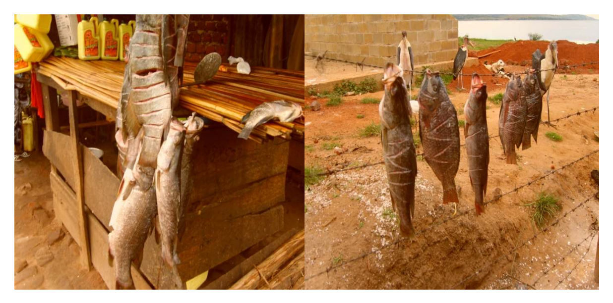
Figure 4: Drip drying fish prior to deep frying

and move to the fish to feed, but return to the soil when fish gets very hot [18]. The practice of not drying fish products completely and unsanitary conditions also attract flies.