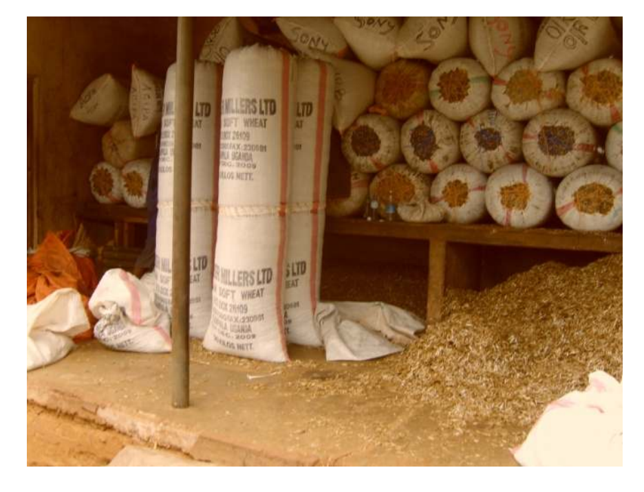
Figure 2: Stacked gunny bags of dried mukene in storage stall (Kiyindi landing site)

The other threat to the nutritive value of mukene , is the process in which it is stored. Dried mukene , including the partially dried product, is packed in gunny bags (also called poly bags) that lack aeration and hence renders the product susceptible to degradation. The problem is aggravated by the practice of stacking bags atop slabs of cement as shown in Figure 2 below. Bags at the bottom are subject to rotting from condensation from the slabs and the heat that accumulates inside the bags favors microbial activity and growth of moulds. Mukene stored under such conditions requires regular airing but this is often not possible because bags are heavy and stacked high which makes it hard to access bags that need airing.