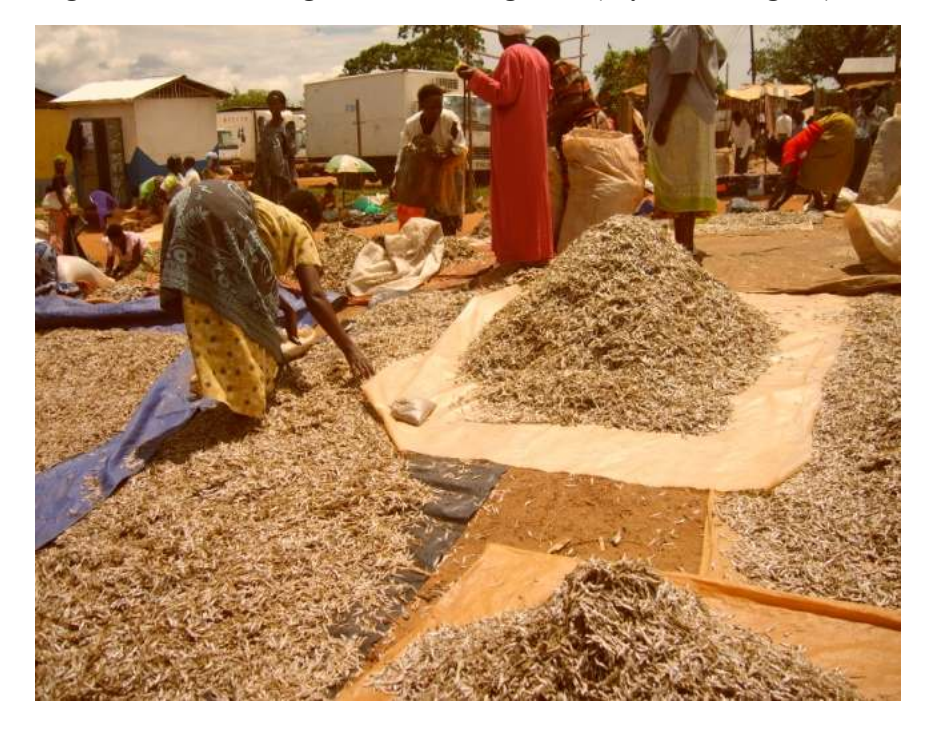
Figure 3: Women airing mukene in storage area (Kiyindi landing site)

Some storage areas also do not have adequate space for airing, as visible in Figure 3 below, and the product is often subject to losses from birds and weather elements. Degraded mukene and mukene dust is often diverted to fishmeal for animal feed but some rotten mukene sometimes ends up on local markets, where it becomes a potential health hazard for local populations.