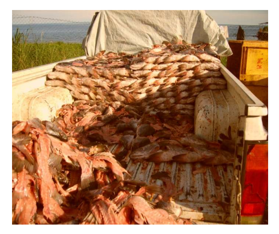
Figure 1: Fish skeletons sold from the back of a pick-up truck

products rancid due to oxidation of lipids [10]. In addition, the metal surface easily gets hot and transfers even more heat to the fish products while the canvass that covers the fish traps in heat, further accelerating all kinds of oxidative and enzymatic reactions that lead to spoilage of the fish products.