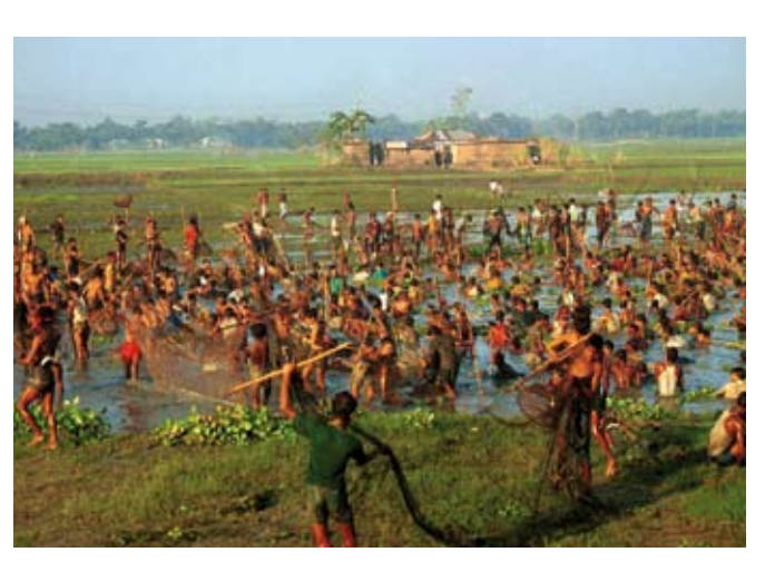
Local fishers and villagers work together to catch fish as flood water recedes in a Bangladesh floodplain