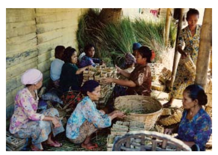
Women in Pekalongan, Indonesia, preparing traditional "pindang" products