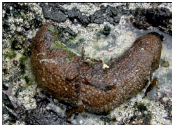
Holothuria portovallartensis