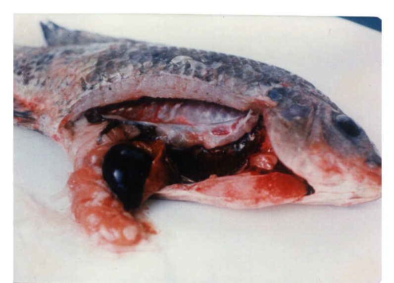
Photo 3. Nile tilapia (O. niloticus) showing distended gall bladder, the intestine is filled sero-hemorrhagic fluid and gases with congestion of the internal organs extensive skin hemorrhage, tail and fin rot and ulceration.

Photo 2. Nile tilapia ( O. niloticus ) showing sero-hemorrhagic fluids exuded from inflamed vent.