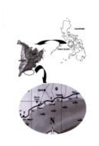
Fig.2 Location of SICRMC

On February 10, 2002, a Memorandum of Agreement was signed by the mayors of the municipalities of Guimbal, Miagao, Oton, San Joaquin and Tigbauan creating the Southern Iloilo Coastal Resource Management Council (SICRMC) (Fig.2). The objectives of the Council are; to help in the restoration of the productivity of the coastal waters of Southern Iloilo, strengthen the capabilities of the local government units in the management of their coastal resources, educate the fisherfolk in the sustainable utilization of their coastal resources, and develop and promote alternative livelihood schemes for the fisherfolk.