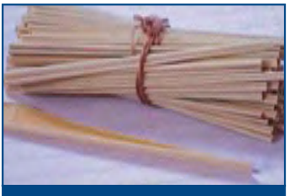
Figure 3. Rolling cigarettes using young Nypa leaves, a major secondary livelihood activity.

All these changes highlight the fact that the tsunami related alterations to the mangrove habitat have impacted the inhabitants of these areas. Mangrove crabs and shrimps depend on a healthy and productive mangrove ecosystem. The local communities expressed the fear that the increase in the number of fish. crabs and prawns would not last because: (1) eventually the young fish and other aquatic species will need healthy mangroves to survive; and (2) continued intense fishing amidst the surviving mangrove ecosystem will quickly deplete stocks.