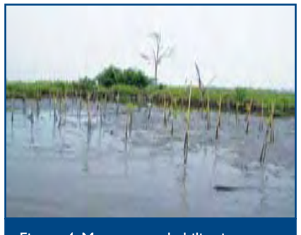
Figure 4. Mangrove rehabilitation - planting of propagules in Samatiga in Aceh Barat district.

The Master Plan for the Rehabilitation and Reconstruction of the Regions and Communities of the Province of Nanggroe Aceh Darussalam and the Islands of Nias Province of North Sumatera, henceforth called the Master Plan. is a critical national document for medium-term rehabilitation and reconstruction efforts. In the Master Plan following the tsunami, the Government of Indonesia set a five year planting target for a mangrove cover of 164 840 ha for the whole of Aceh province. On the west coast of Aceh, the largest forest based rehabilitation, involving a number of NGOs and government institutions, is in the district of Aceh Barat (Fig. 4). This has been done partly through