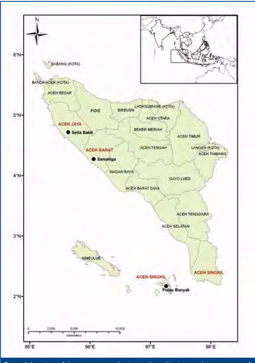
Figure 1. Location of the mangrove study sites in three districts on the west coast of Aceh province, Indonesia.

A global survey by the Food and Agriculture Organisation indicated that over 1.3 million ha of