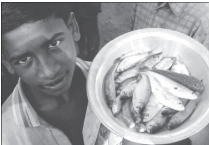
Fish farmed from rice paddy, Bangladesh University of Stirling, UK, 2006

Fishing people are often labelled 'the poorest of the poor', but fishing incomes can be higher than wages from farm labour. However, many people in fishing communities live in deprived conditions. Vulnerability to natural hazards (such as floods and storms) is high, due to physical exposure and vulnerable livelihoods. Many settlements are temporary and unofficial, and do not benefit from state-delivered services such as health and education.