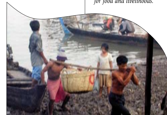
WorldFish's efforts to help developing countries sustain and manage aquatic systems for food and livelihoods.

systems and determining whether compliance with these food safety standards is likely to promote or hurt aspiring exporters' access to world markets. A project titled "Fish Fights over Fish Rights" is leading to policy guidelines and strategies for minimizing conflicts related to increased competition for access to steadily declining stocks