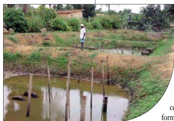
The WorldFish technologies can be integrated into traditional small-holder farms, combined with rice farming or even carried out in backyard ponds.