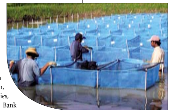
Genetically improved farmed tilapia, or "GIFT" fish, are now being farmed in 13 countries in Asia alone.