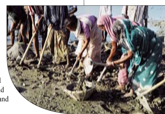
Along with its partners in a CGIAR Challenge Program, the WorldFish Center is investigating and promoting the use of saline water in crop and livestock production, especially for fish production.