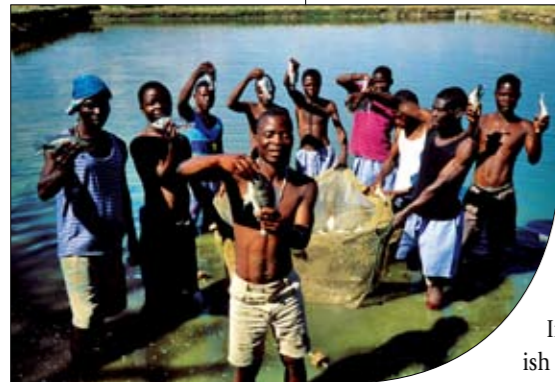
The fishery sector contributes vitally to the food and nutritional needs of 200 million Africans, and 30 to 45 million derive their livelihoods from fishing and related activities.