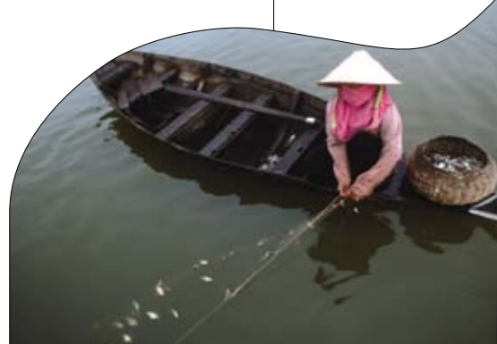
Technical assistance provided to Cambodia's Inland Fisheries Research and Development Institute (IFReDI).

In a decade-long research project, WorldFish and a large network of scientific partners, used selective-breeding techniques to develop a superior strain of Nile tilapia ( Oreochromis niloticus ) that grows 60 to 85 percent faster.