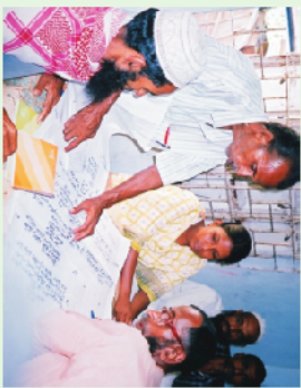
Stakeholders identifying their information needs.

Using the guidelines, the stakeholders, representing the Departments of Fisheries and Agriculture, partner NGOs (PNGOs), Community Based Organizations (CBOs), Local Government Engineering Departments (LGED), the Bangladesh Water Development Board (BWDB) and Local Government and Rural Development (LGRD) were able to discuss and agree upon stakeholder roles and responsibilities by means of small group discussions, and a voting approach.