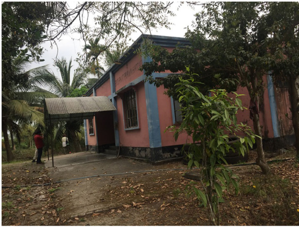
Fig. 2 A mothballed prawn hatchery in Bagerhat, SW Bangladesh

carcinogen and used by some hatcheries as a prophylactic or upon signs of necrosis (Jakiul Islam et al. 2014).