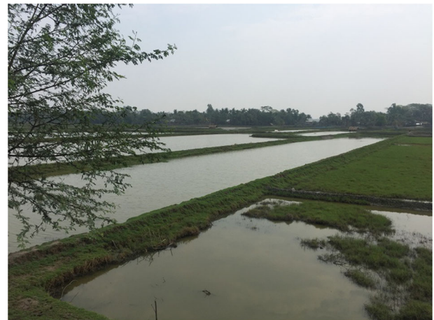
Fig. 3 Typical 'ghers' in SW Bangladesh - flooded and embanked rice fields used for the cultivation of shrimp

Disease was a common issue for most farmers, with nearly 85% of farmers reporting a range of diseases in shrimp and prawn in