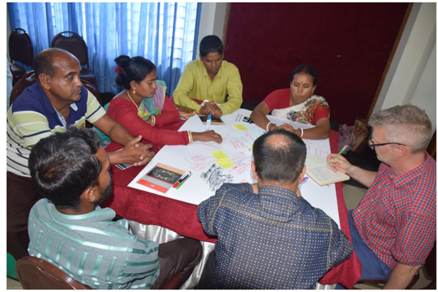
Fig. 4 Farmer group mapping out the components of a pond system

Second, the participatory modellers' expansive diagrams of pond processes opened up the breadth of potential AMR risks. While this mirrors the scientific literature on the multiple drivers of resistance (see earlier), it is generated from a different knowledge base – one rooted in an appreciation of the social and ecological processes that condition a pond. As farmers described their ponds in relation to flows of materials, environmental relations, and stressors, a range of possible sources of antimicrobial compounds became apparent. Competency groups highlighted the use of antimicrobials in hatcheries as a possible source of resistant bacteria. They suspected feeds, particularly commercial pellets, contained antimicrobial compounds. Farmers complained that feed was often of poor quality and would quickly degrade in the hot and humid environment. Companies were increasingly claiming longer shelf-life and enhanced results from using their feeds, something that was likely to signal the off-label addition of antimicrobial compounds into the feed. Some talked of the hard-sell applied by commercial feed and pharmaceutical companies who were keen to push products, including antimicrobials, at farmers and supply shops. Other 'organic' feeds were also thought likely to pose AMR risks. Waste from poultry farms, where antibiotics are used in large quantities, were used to fertilise ponds. The role of detergents and pesticides as potential