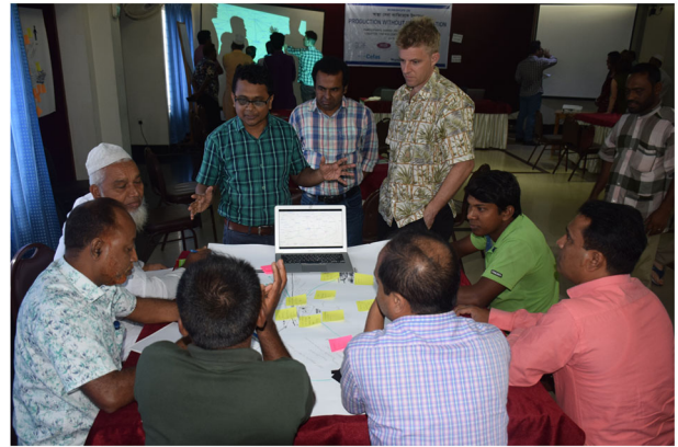
Fig. 5 Group discussing the composite model

contributors to resistance were also included in the participatory exercises. Finally, the models highlighted the openness of ponds, with inundation (during monsoon and cyclones), as well as outflow from neighbouring farms, from hospitals and both agricultural and industrial land uses, likely to affect the pathways and potentials of resistance conferring materials.