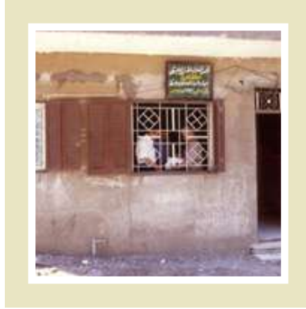
The modest offices of the Fayoum Fish Farming Association. Membership is growing fast, as people recognize the key role it plays in making modern pond management a success in this area.

This was the kind of knowledge collected during the study. Everyone came out much wiser and, at the end of the year, the fish were sold and the results calculated (we will return to those results in just a moment).