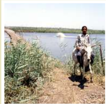
On this farm, ponds are aerated efficiently, using a modern, propeller-based system. This means that the fish remain comfortable even in very hot waters.

example of one of the simple management issues that needed to be addressed, let's take a closer look at Nazmy and Gouda's fish farm. If you walk by the side of one of their greenish ponds with one of the WorldFish Center's scientists you will learn, as the farmers did, that the pool does not require fertiliser, at least not right now. Plankton is in abundance, and you will actually lower the water quality rather than enrich the food base if you add fertiliser. Obviously there were many aspects of pond management that needed to be addressed.