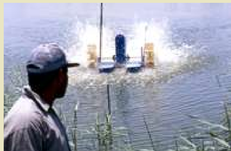
The fish farmers have to observe water quality closely to make sure that the chemical balance is just right and that oxygen is added from the air now and again. A good job ensures fast fish growth and high survival rates.

the co-operative grew to 257 members (its present number), which is about 85% of all the fish farmers in the province. This has, of course, made the co-operative a very serious partner for the businesspeople who deliver fish feed: the co-operative has negotiated very good deals and interest-free credit for its members. It has even convinced the industry that they should deliver to the farm gate, at no cost of course. This was unheard of before.