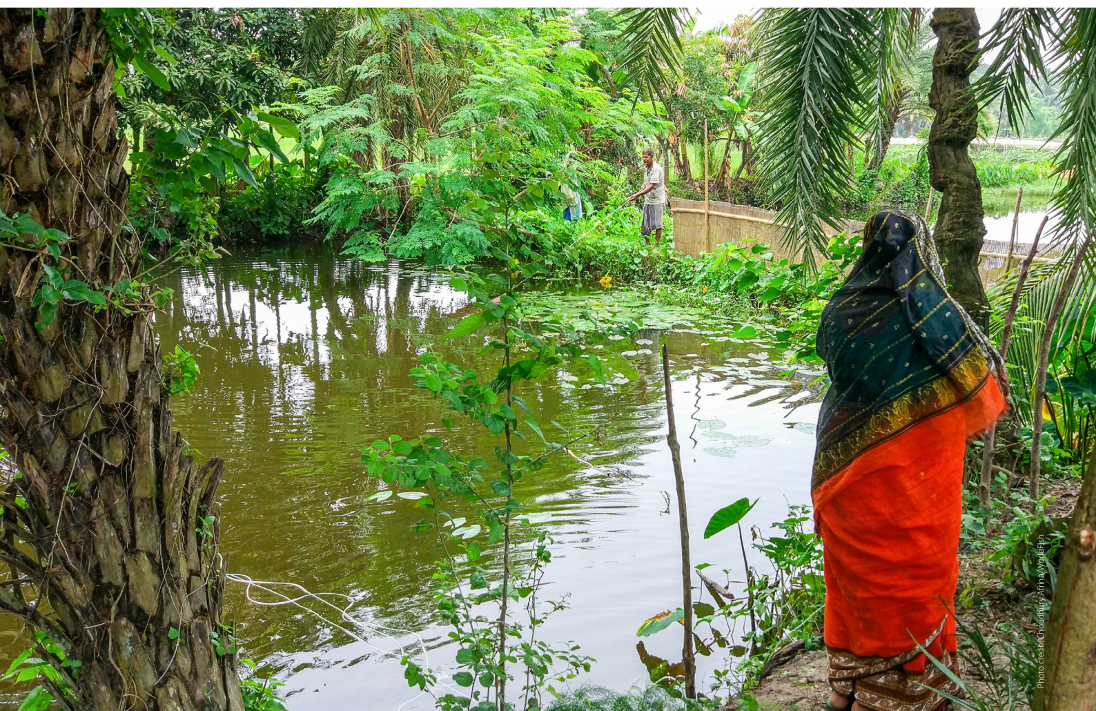
A woman watches as her husband catches fish.

6. Social norms should not be overlooked. Even with resource ownership and the knowledge to effectively use a resource, social norms and stereotypes around what roles are deemed appropriate for women can hinder their capacity to use and benefit from a resource. For example, the study showed that women are not able to access ghers because of such normative constraints, or women who do legally inherit property find it difficult to exercise their decision-making rights. Therefore, aquaculture projects should take steps to build family and community acceptance around new roles for women. What could help are exercises that aim to change perceptions and behaviors, open dialogue on hopes and fears, attain buy-in from community members and build an understanding of the benefits to the family as a whole.