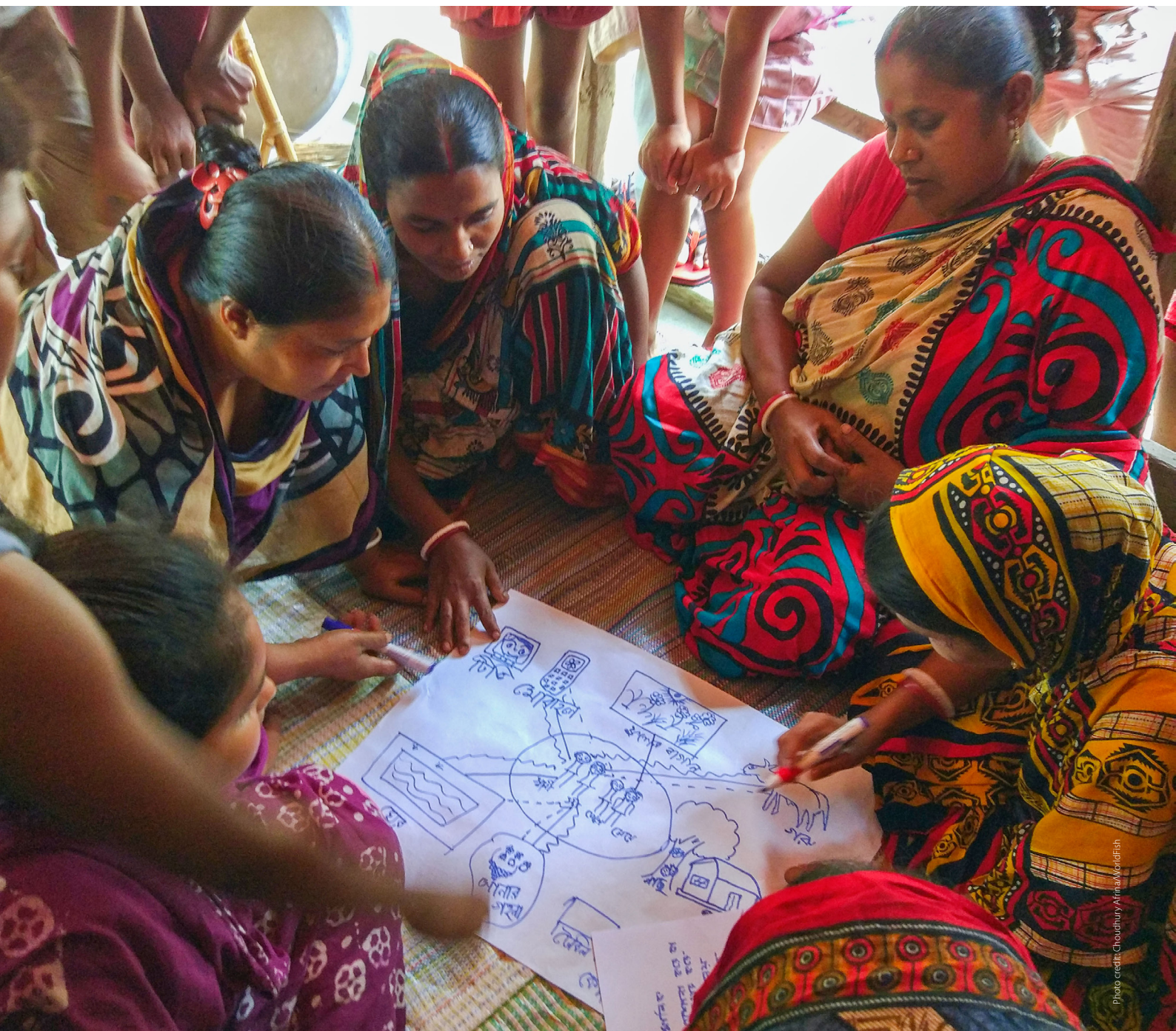
Asset ownership, control and access mapping exercise with Hindu women’s group.

In this brief, the terms “asset” and “resource” are used interchangeably. They refer here to goods and services with economic value that are owned or controlled by individuals or groups to produce products for current or future benefits. They include land, ponds, seeds, financial capital, tools and technologies.