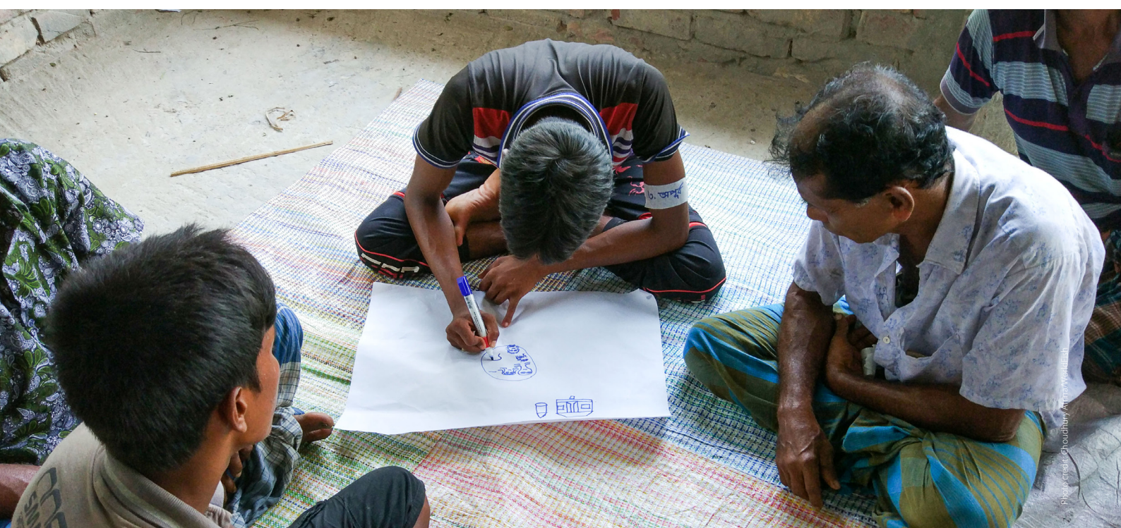
Asset ownership, control and access mapping with men's group.