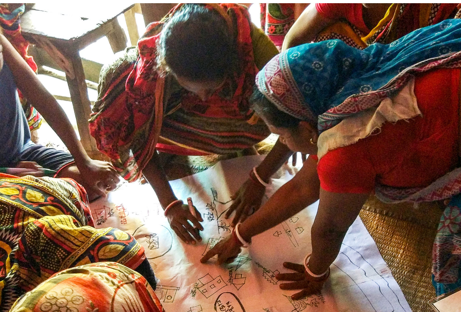
Village resource mapping with women's group.