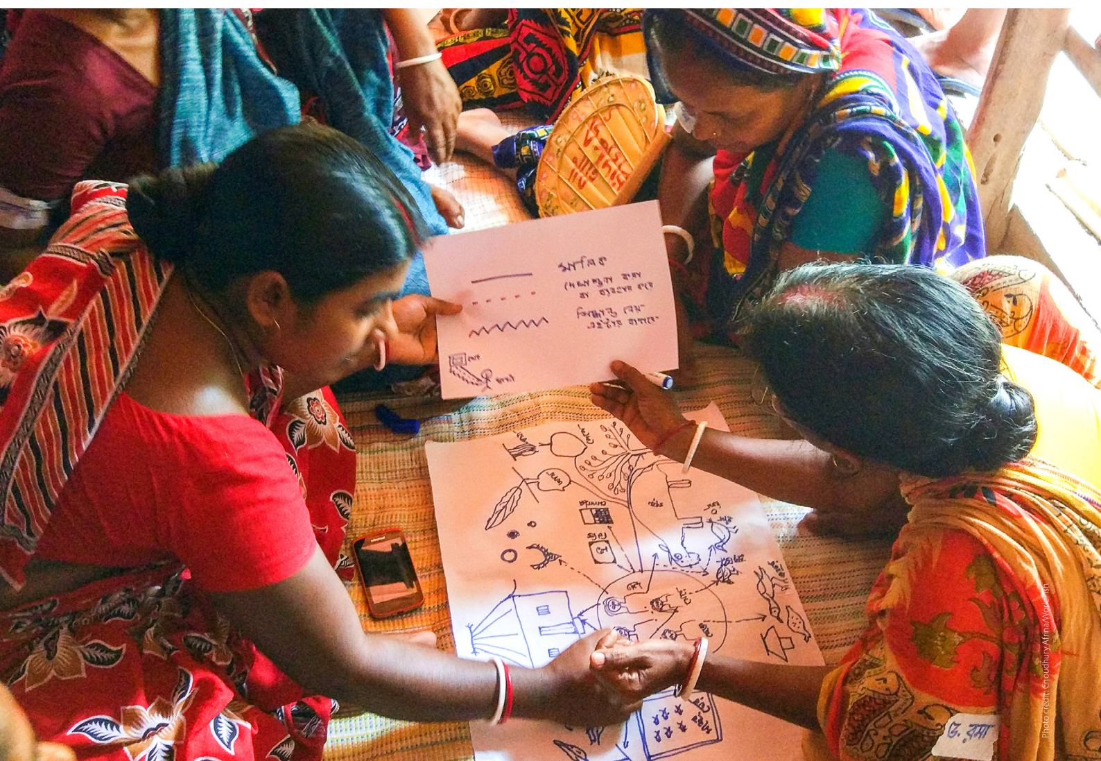
Asset ownership, control and access mapping with Hindu women's group (low income).

participants' families have remained in a joint family system of ownership and sharing to be better able to maintain, acquire or lease resources and share risks and accountability. However, some married women expressed dissatisfaction with this system because their opinions about how to use and derive benefits from the resource are sidelined by the decisions of older male relatives, who determine resource use and the distribution of the benefits. "Living in a joint family that has built everything from scratch is hard," said a Muslim woman from a middle-income family. "Every single thing has to be shared and discussed. I cannot express or try to achieve my own desires. Even a piece of fish has to be distributed between our four families. It does not matter who put in more work or money. Everything is everyone's." Most male youths also expressed similar dissatisfaction with having to obey their father's orders about resource use and said that they would have used the resource more innovatively if it were legally theirs. As a solution to this problem, some youths mentioned that they informally form groups with other youths to pool money and acquire aquaculture resources.