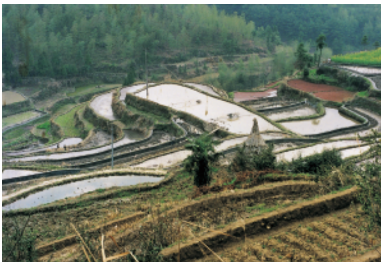
Fig. 7. Fish paddies on the mountain areas of Oujiang River basin.