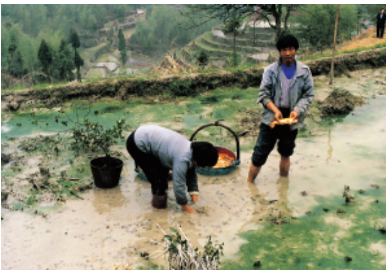
Fig. 8. Harvesting red carp in paddy terraces.