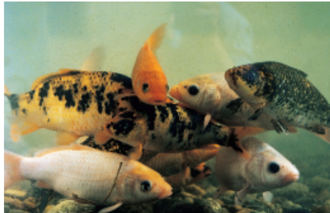
Fig. 4. Oujiang color common carp.