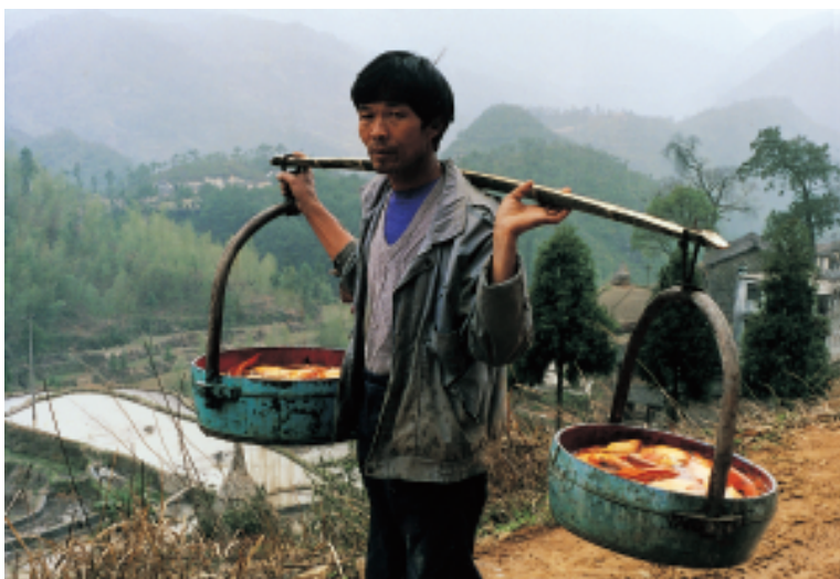
Fig. 9. Bringing fish home.