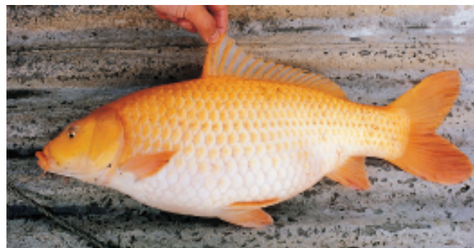
Fig. 1. Xingguo red common carp.