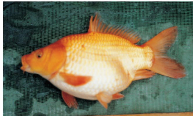
Fig. 2. Purse red common carp.