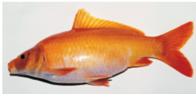
Fig. 3. Glass red common carp.

Glass red common carp originated from four mutant individuals of a farmer’s reared population in Wanan county in 1963. Its morphology was very close to the Xingguo red common carp except for its transparent color. After 6 generations’ selection between 1973-1983, the body remains transparent and the gut and gills can be seen from the outside in the larval