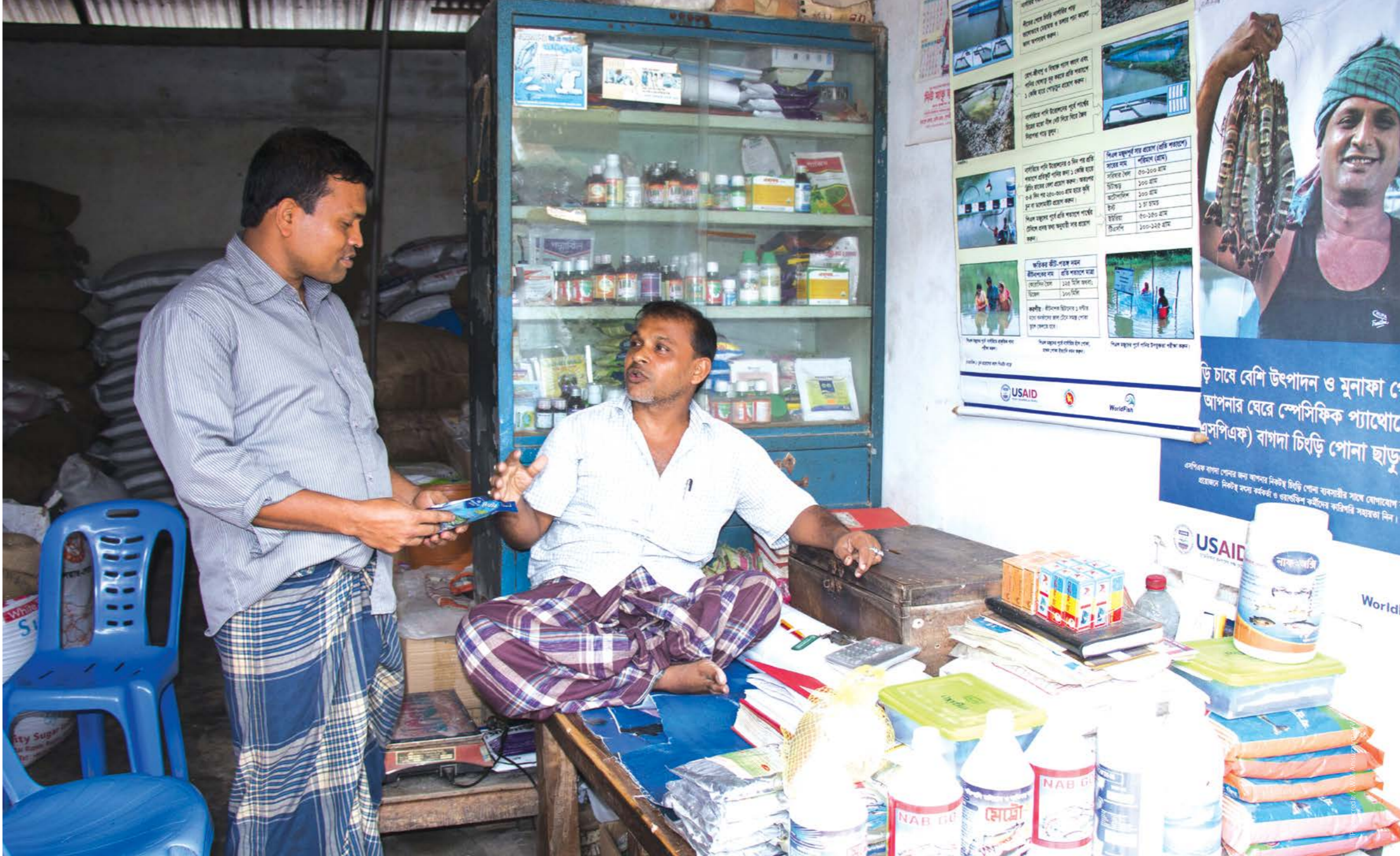
A shop owner and private sector facilitator explains the features of a product to a customer.

The LSP model has created important sustainable benefits for both fish farmers and the LSPs, which should continue long after the AIN project has ended.