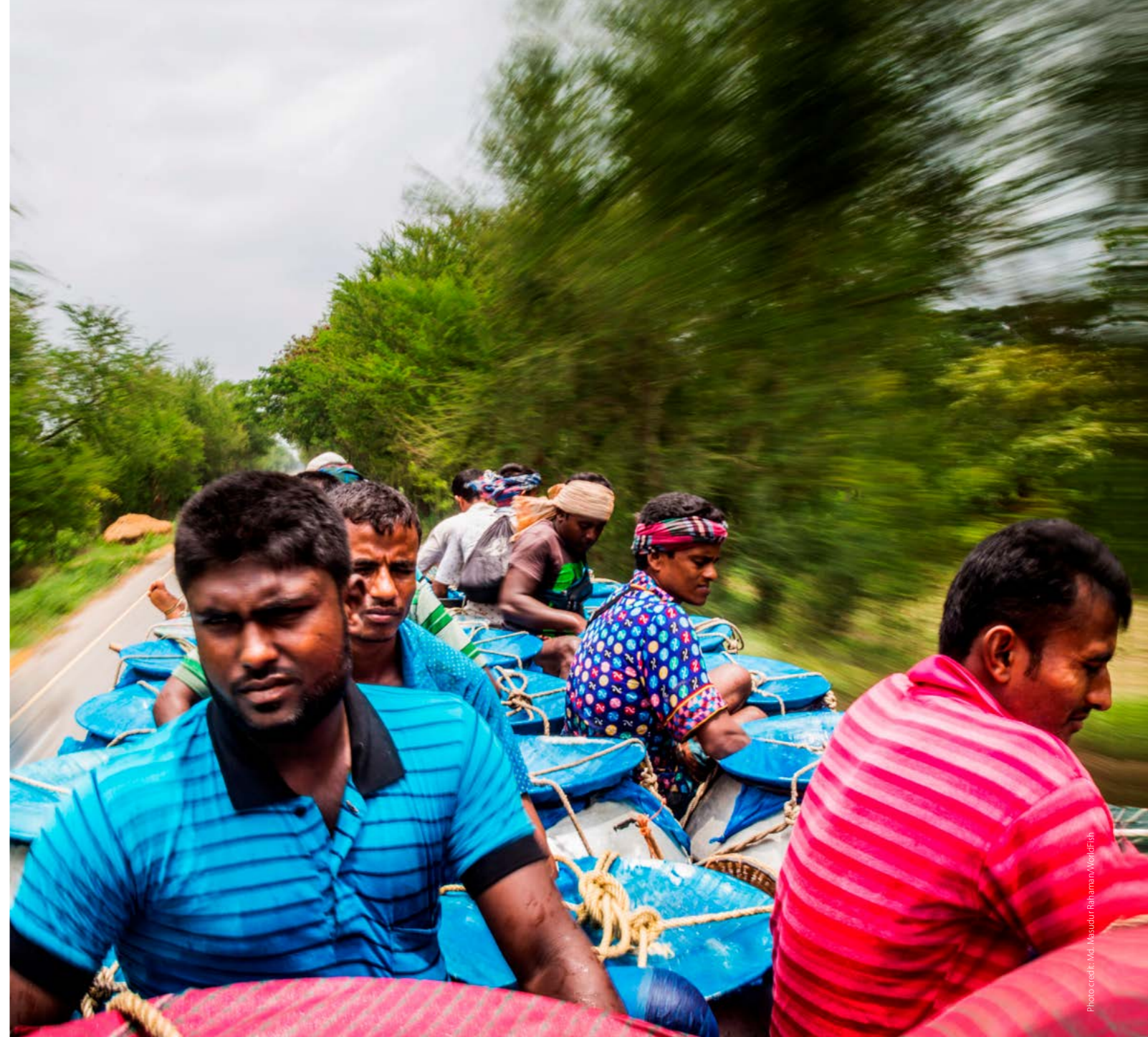
Fry traders (patilwalas) on their way to sell quality fingerlings to local farmers.