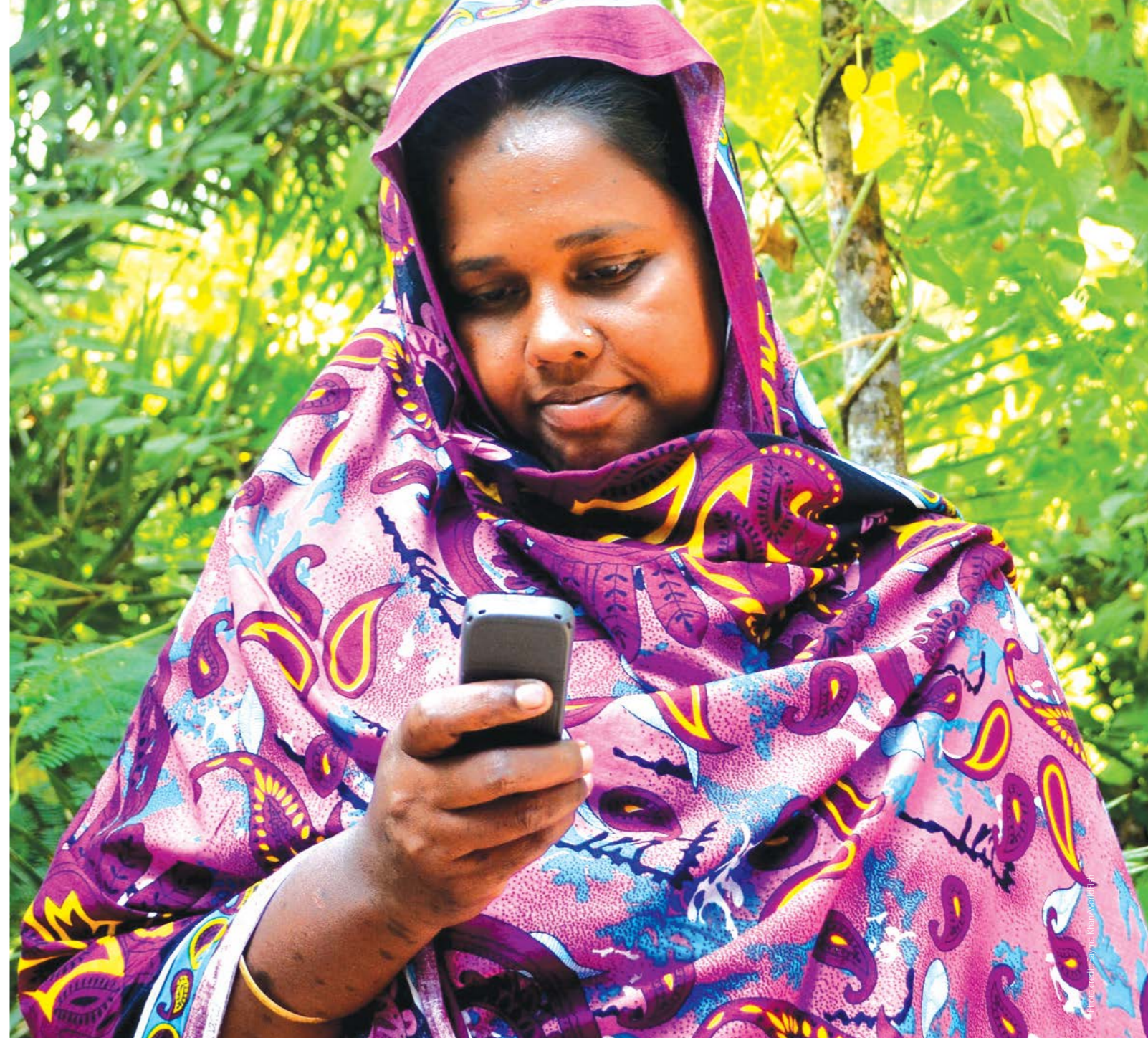
A rural woman using mobile money.