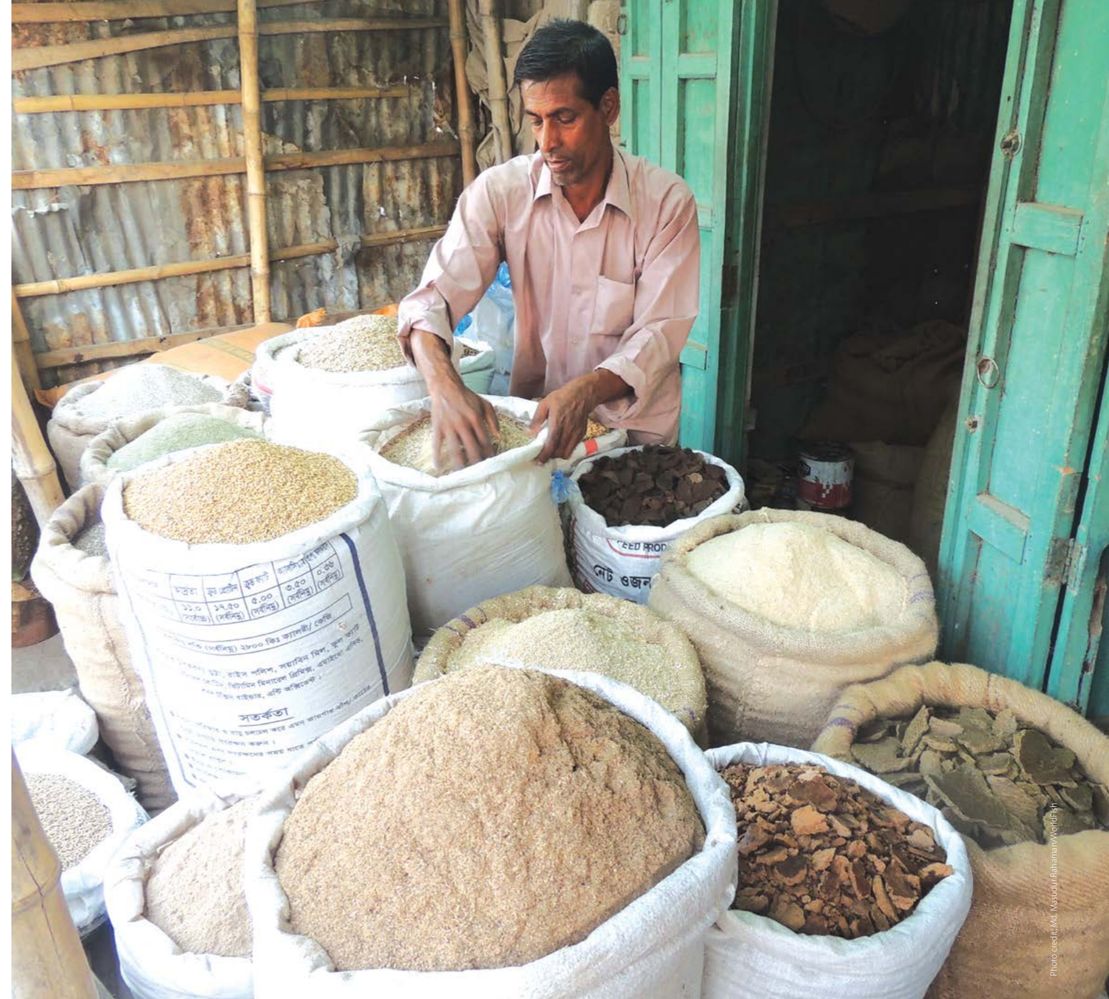
A fish feed seller organizes his products in a shop.

Abdul Karim, another farmer from Rajbari sub-district, explained that it used to be difficult for small farmers like him to buy small quantities of feed. The dealers were only interested in selling to the large farmers. "But now we can easily buy or make our own feed from these mills."