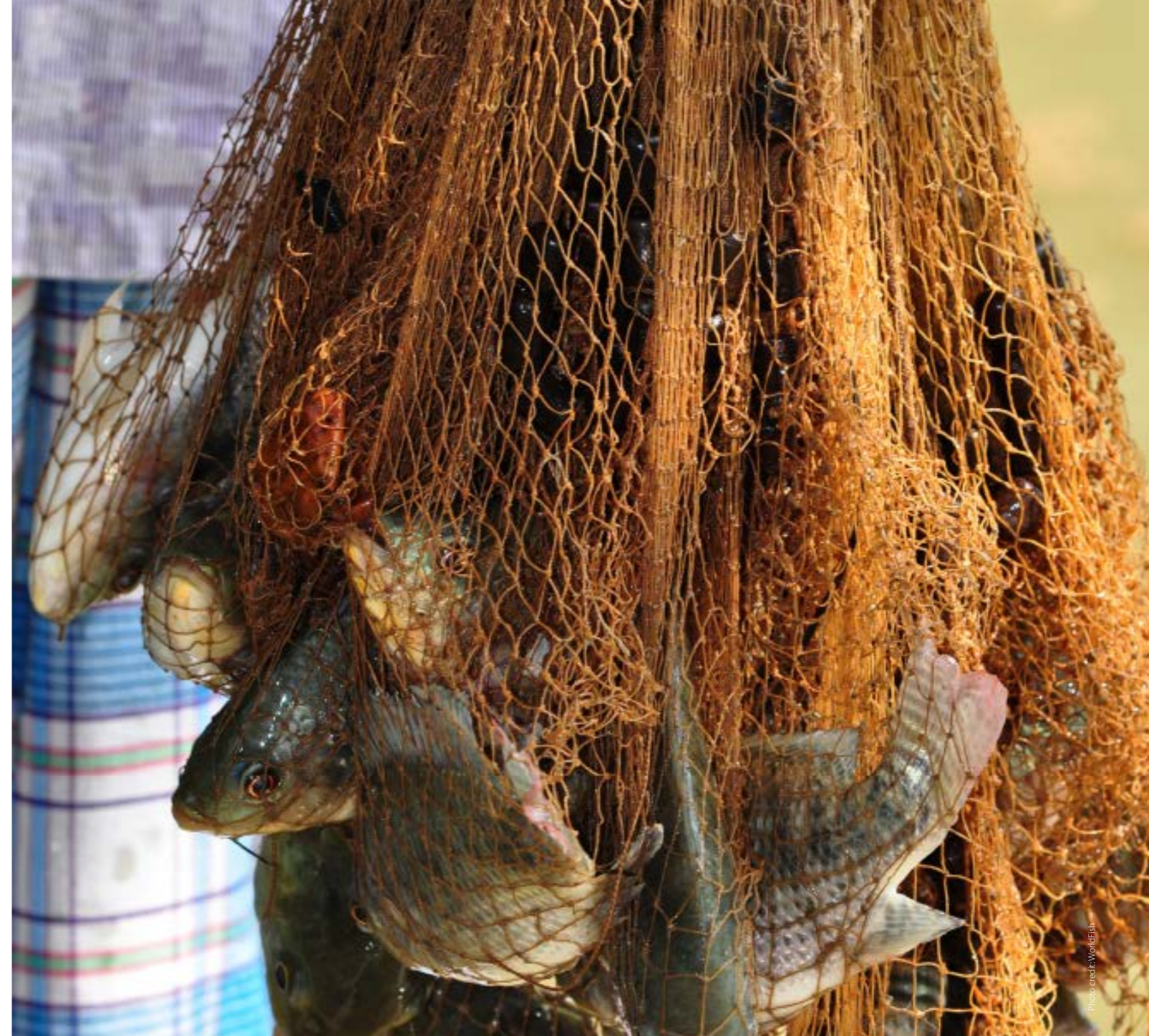
Freshly harvested tilapia.

Between 1 October 2012 and 31 December 2016, AIN was implemented in 20 districts in Barisal, Dhaka and Khulna, focusing on poor communities and particularly women. More than 130,000 farmers, including small- and commercial-scale fish and shrimp farmers, received training on topics including aquaculture technology, nutrition and gender empowerment. Novel information and communications technologies were used during the project, such as a shrimp traceability program, a digital "yellow pages" of suppliers, and a "mobile