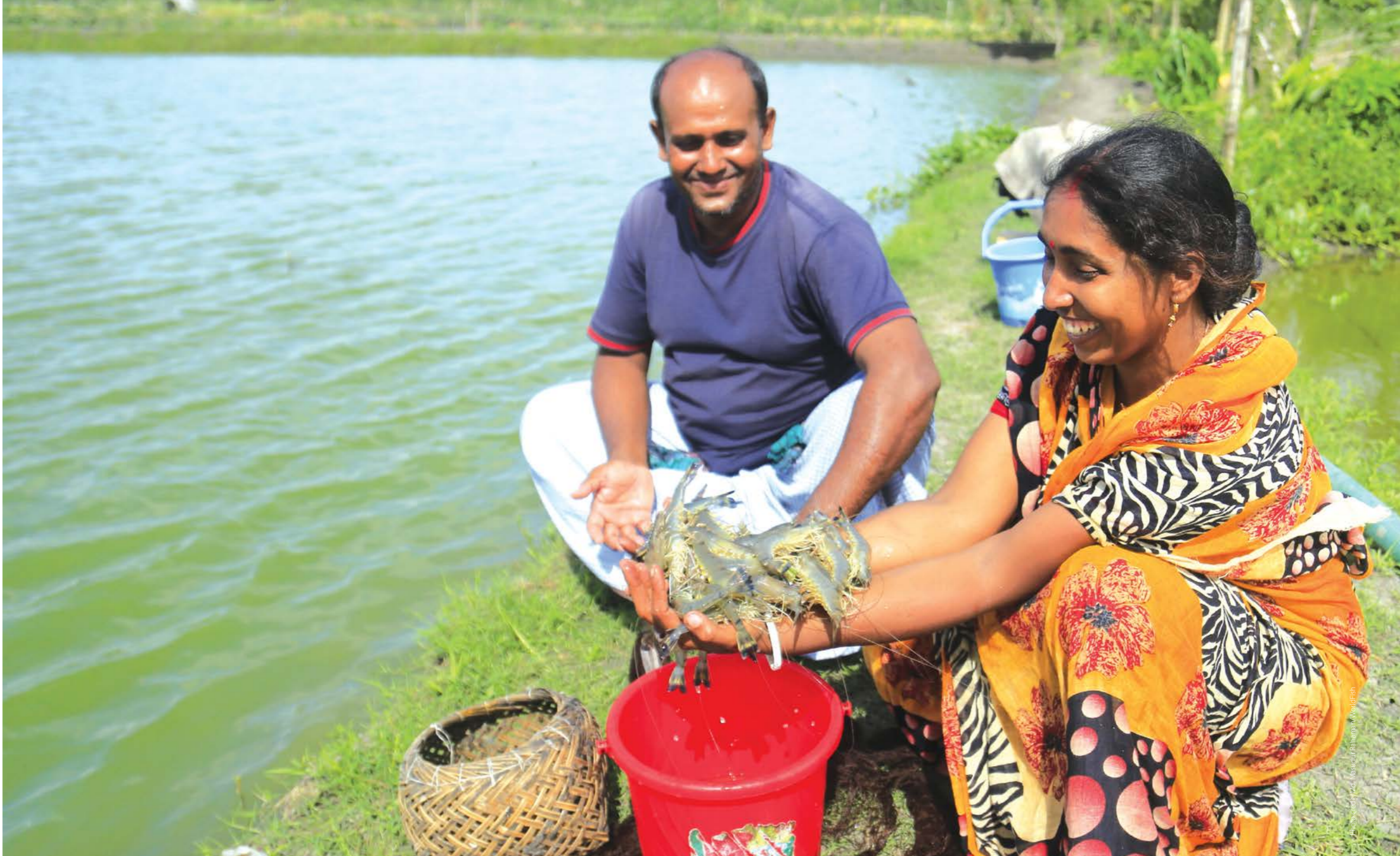
Freshly harvested shrimp from a gher.

It is anticipated that in the coming years more farmers will gain access to PCR-tested seed and know how to use and benefit from it helping to further reduce disease risks and boost overall shrimp production in Bangladesh.