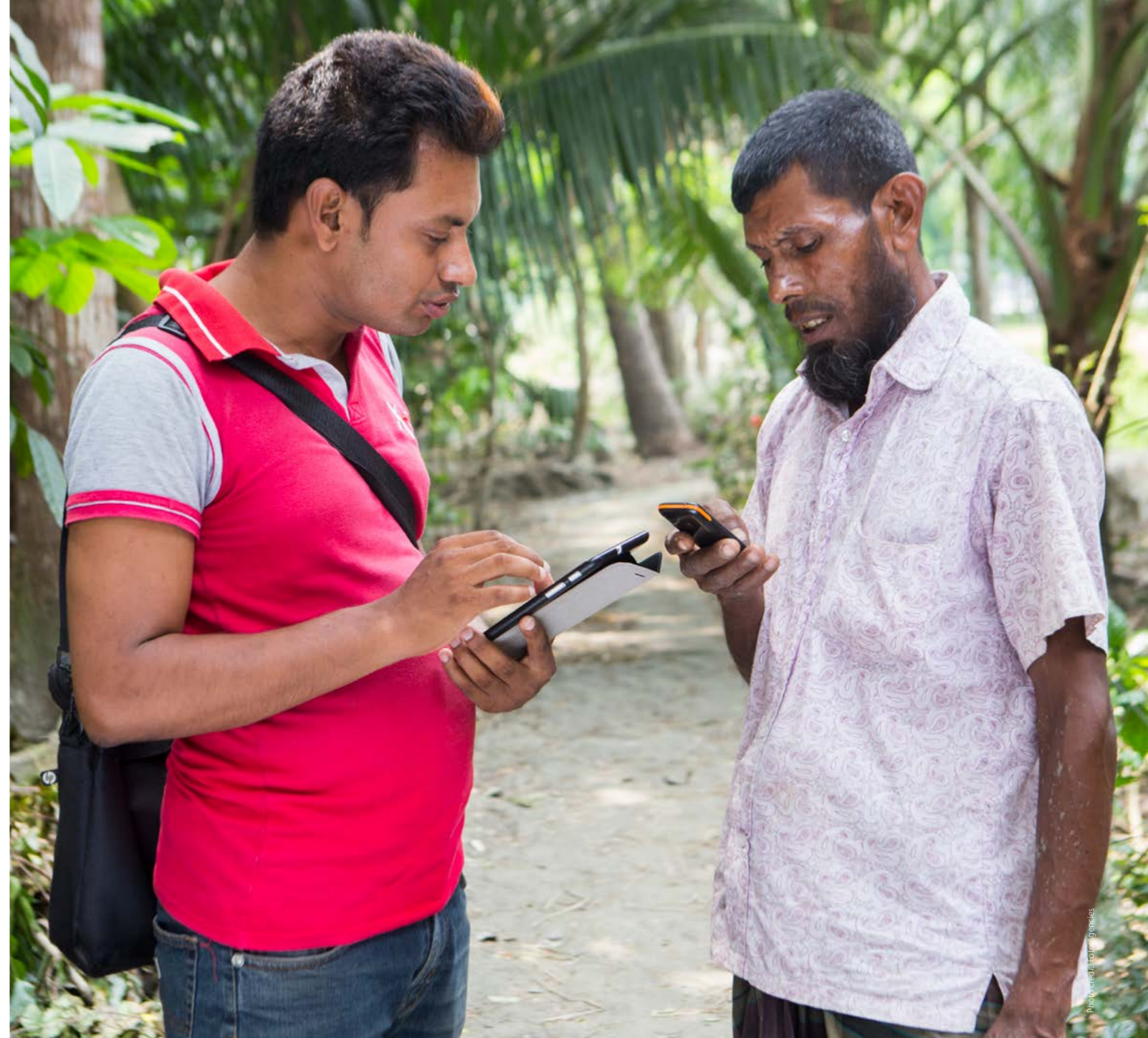
AIN staff deployed ICT throughout the project.

In 2014, with support from USAID’s Mobile Solutions Technical Assistance and Research (mStar) project, AIN reduced its use of cash by adopting a mobile banking system. This enabled field supervisors to send money to field trainers and training participants virtually using a mobile phone, instead of traveling long distances by motorbike to deliver in person. The initiative saved AIN an estimated 600 staff days per year, or USD 19,000 per