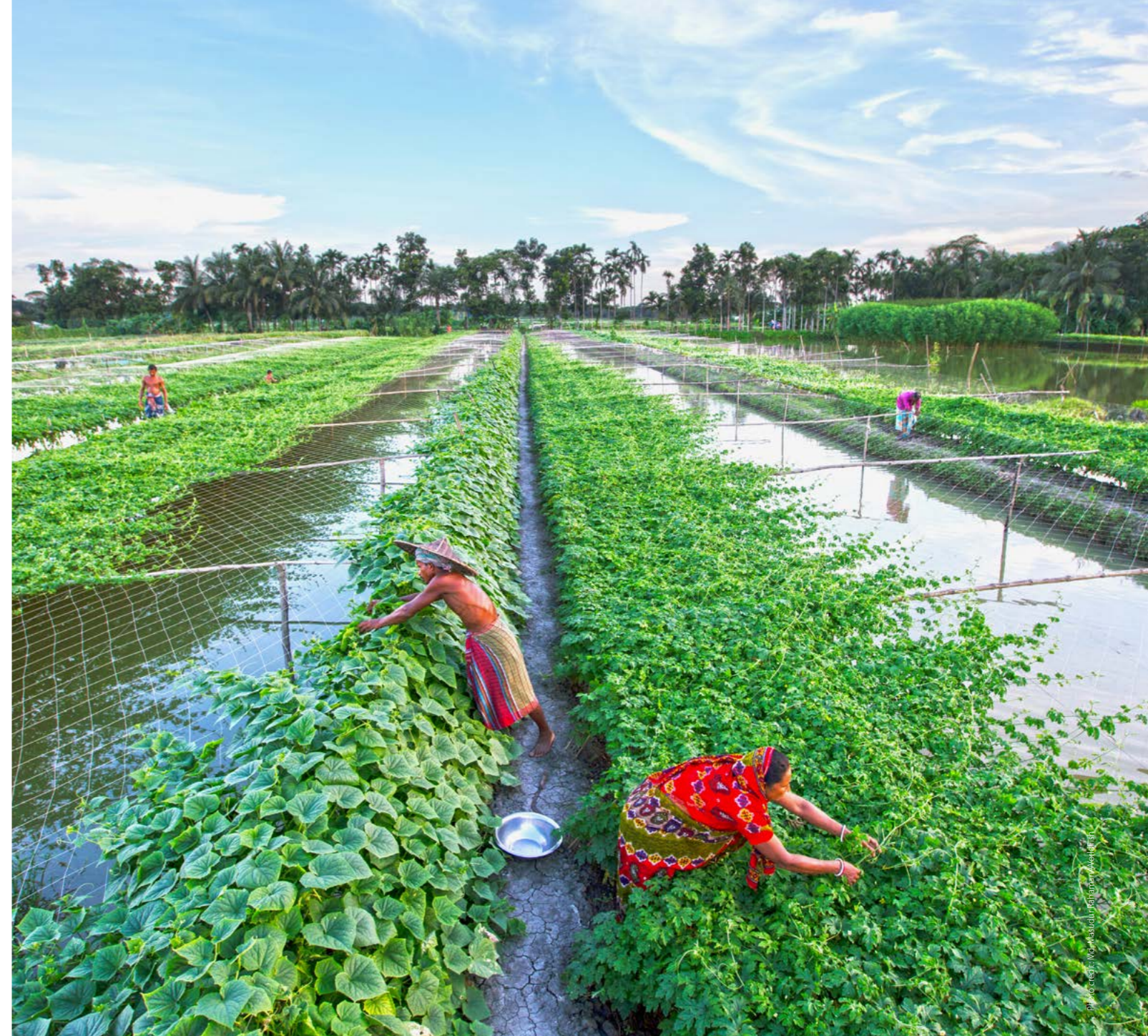
An improved gher system with dike cropping in Southern Bangladesh.

Previously, fish farmer Latika Biswas of Burirdanga village said she thought that mola was difficult to feed to children because it had many bones. "But we