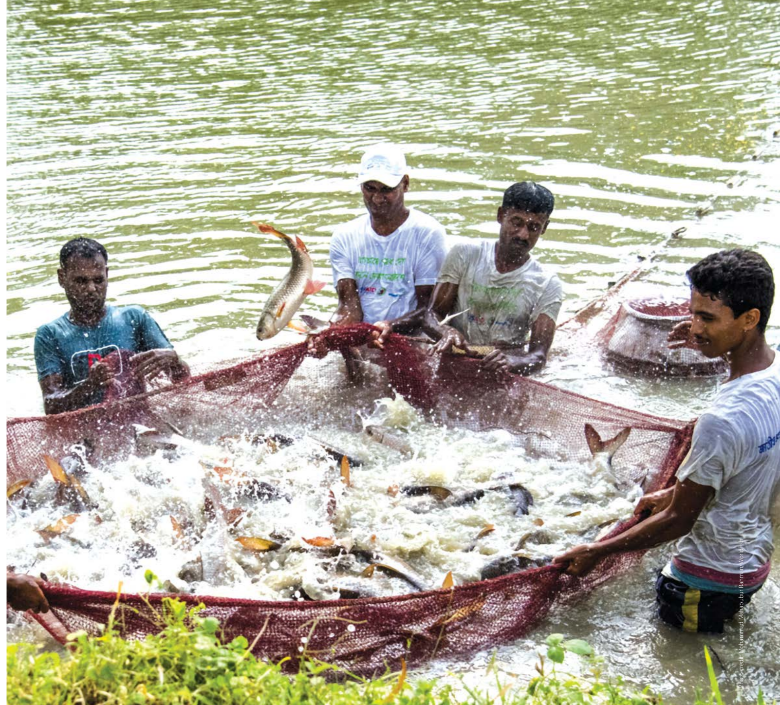
Rohu collected as part of the carp genetic improvement program.

4 million improved tilapia broodstock distributed