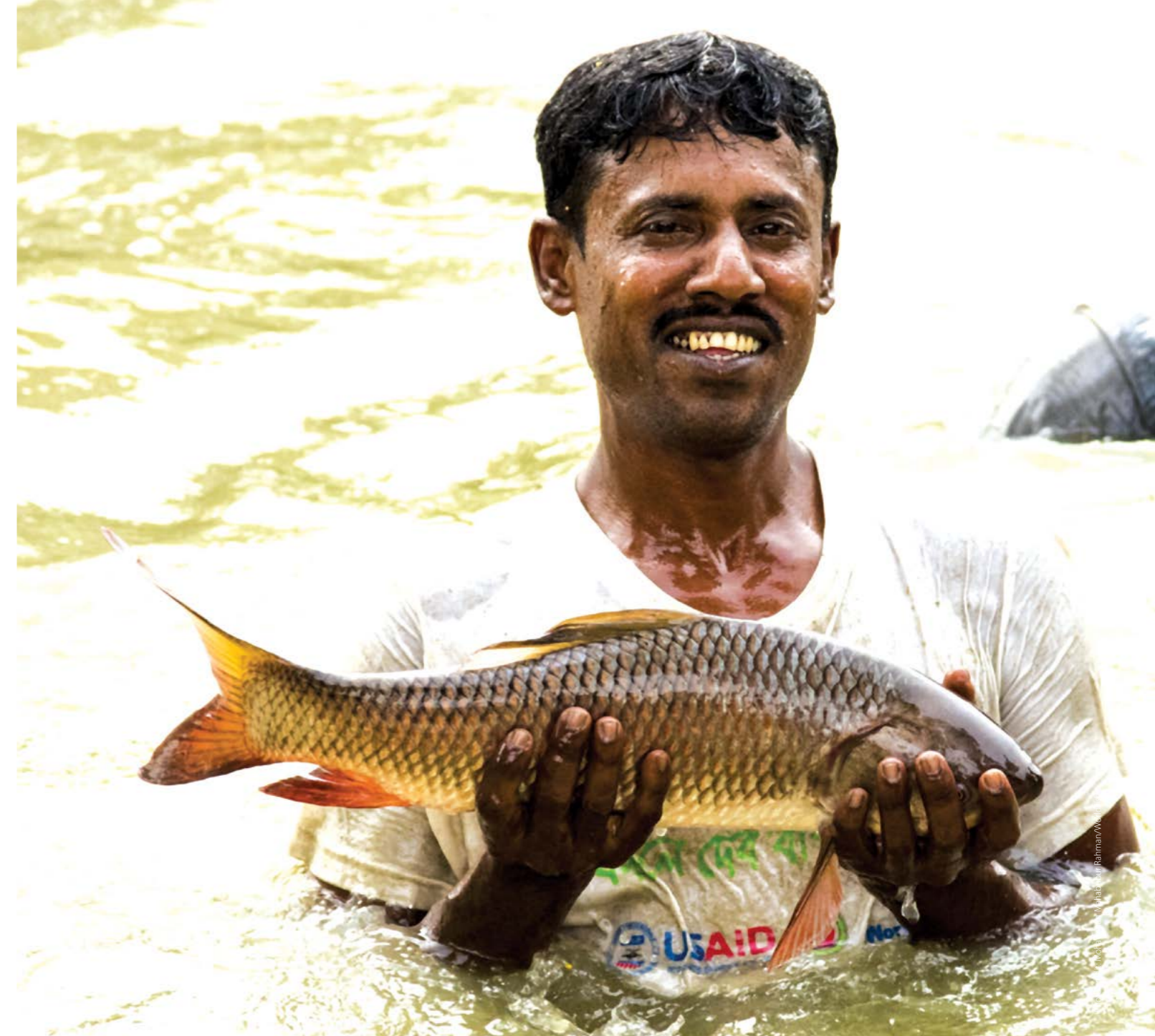
Rohu broodstock from the carp genetic improvement program.

The DoF, with support from AIN, had been working with hatcheries to implement the Hatchery Act (2010) and Rules (2011), which requires them to document the source of broodstock, thereby supporting the effective introduction of improved genetically selected stock. The project supported this by individually tagging broodfish to identify the source of broodstock.