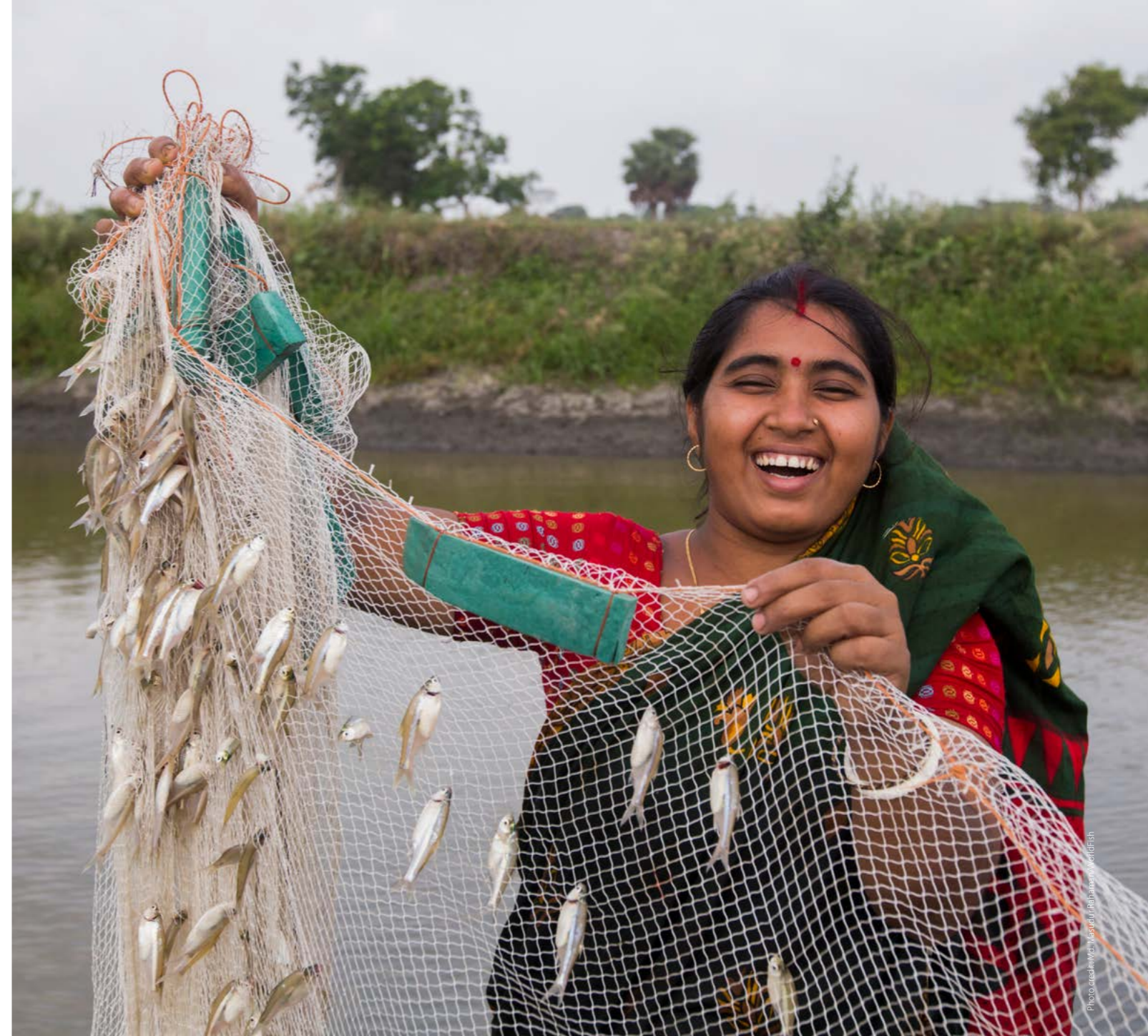
Gill nets have better enabled women to catch fish.

Together, these activities recognize and strengthen the important contribution that women make to aquaculture in Bangladesh, which was vital to AIN achieving its mission of boosting fish production and consumption.