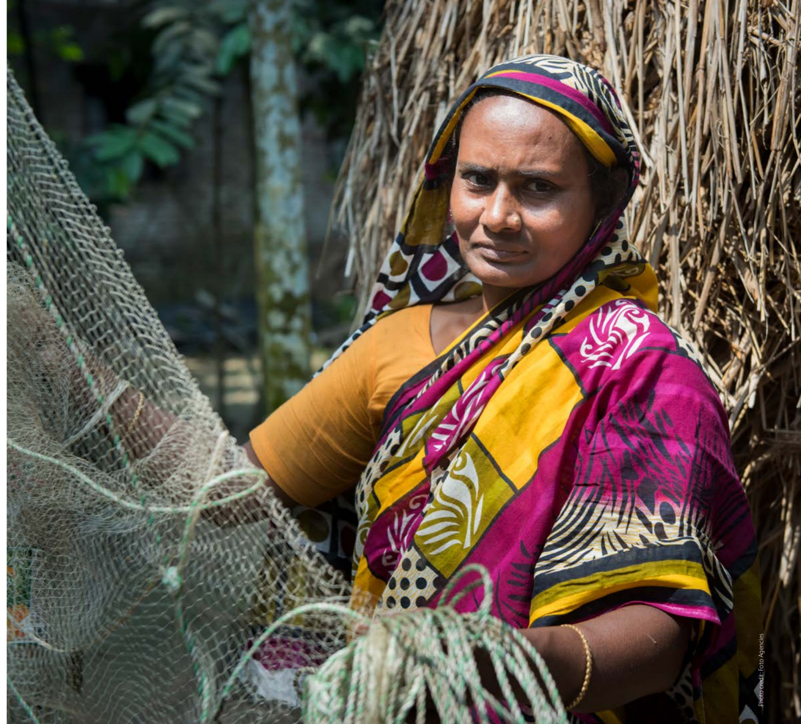
Farmer demonstrating a gill net.

To combat the sociocultural barriers women face and create acceptance of women performing this new harvesting role, AIN introduced social and gender consciousness-raising exercises with household and community members. Preliminary data showed some positive change in aquaculture-related decision-making, gender attitudes and self-efficacy. Women reported that the involvement of their spouse and family members had a positive influence on their adoption of the gill net.