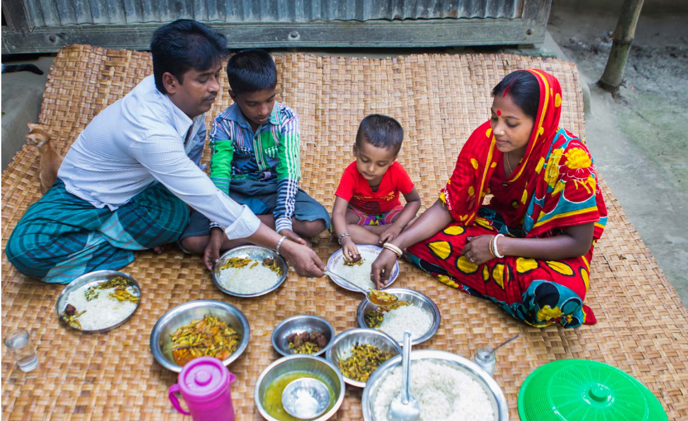
A family eating mola, a small indigenous fish species and an important source of micronutrients.

Together these nutrition-focused activities have helped households increase their consumption of fish and vegetables and diversified their diets, providing families with greater intake of vital micronutrients.