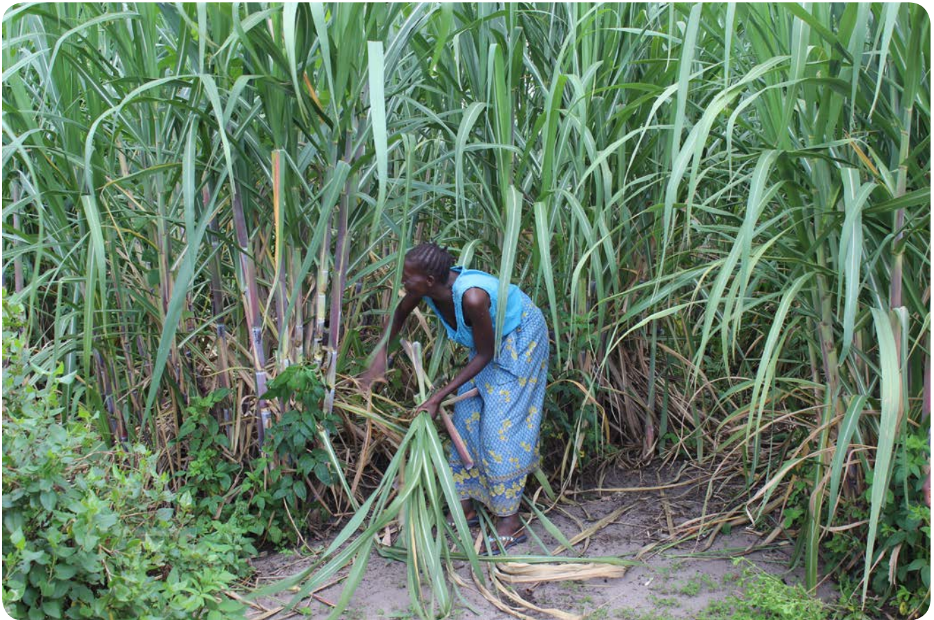
Woman cutting sugarcane in Senanga District, Western Province, Zambia.

stakeholders at multiple levels, could be developed to map a way forward and link it to current efforts by other stakeholders to develop capacities of GSCs, and in particular, GFPs.