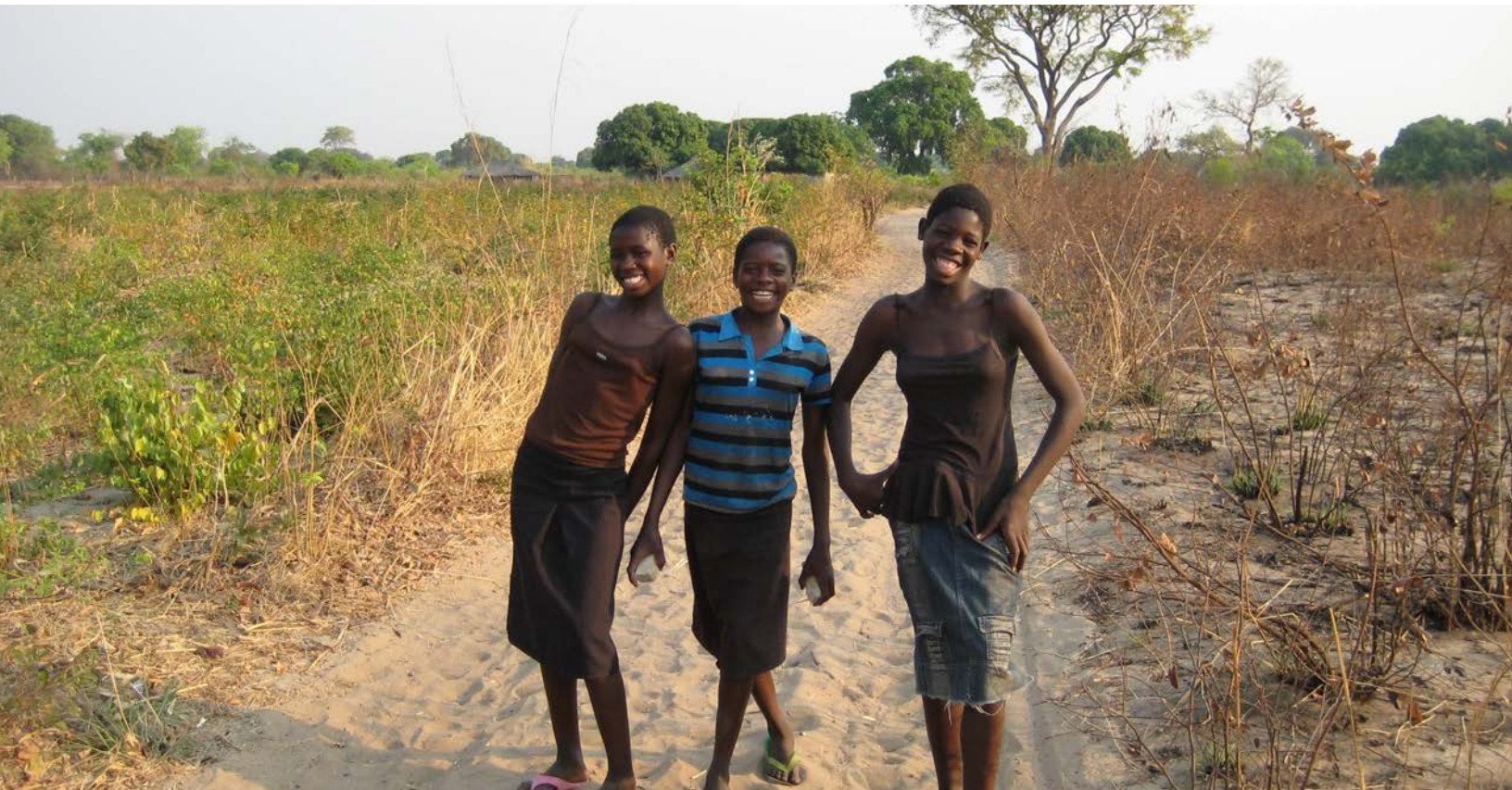
Three girls posing for a photo from Lukulu District, Western Province, Zambia.

3. The MGCD should, with GSC members, provide provincial and district support on strategic planning, monitoring, and evaluation.