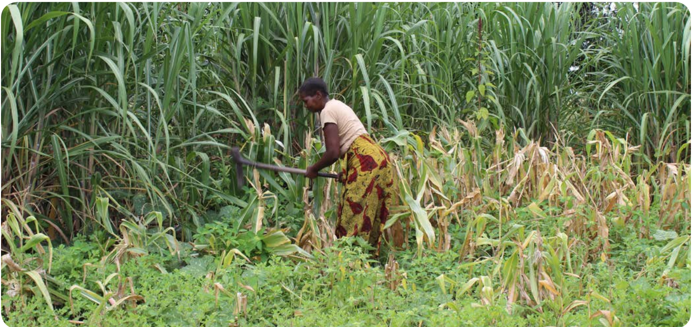
Woman weeding in her garden in Senanga District, Western Province, Zambia.