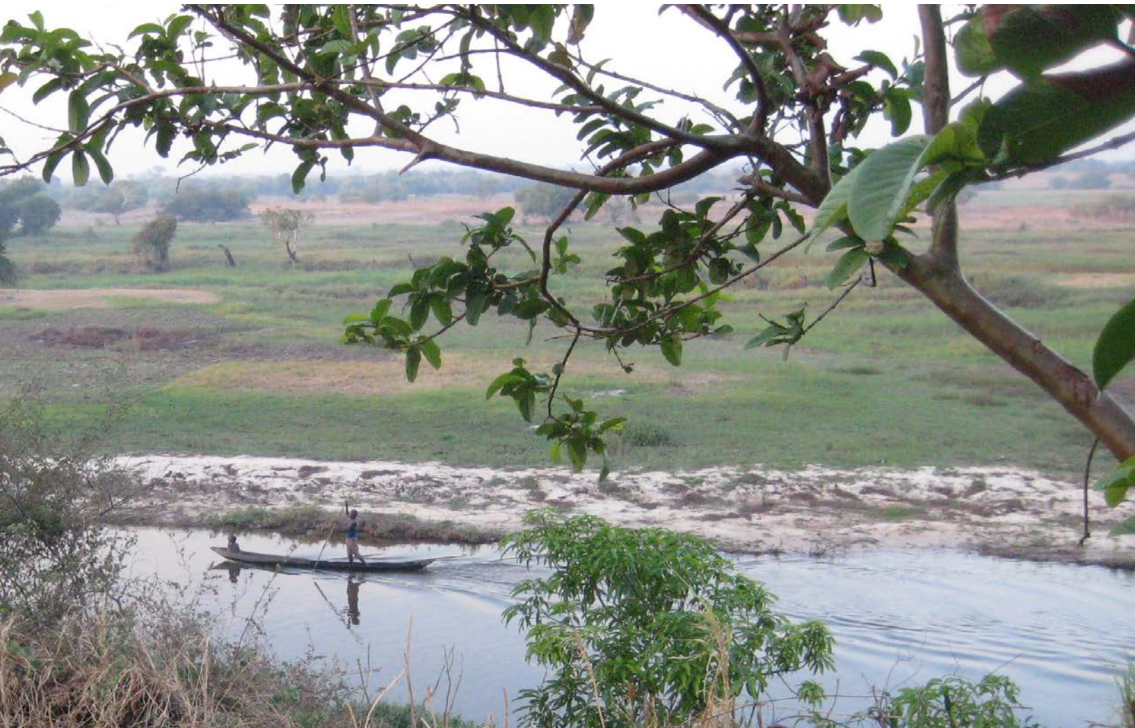
Luangwa River, Mapungu, Western Province, Zambia.