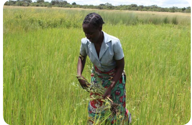
A woman in a rice field in Senanga, Western Province, Zambia.

The Provincial Planning Unit (whose members serve as GFPs for Western Province) is severely understaffed, with three out of 11 positions currently filled. From the point of view of the PPU, this limits their capacities to provide