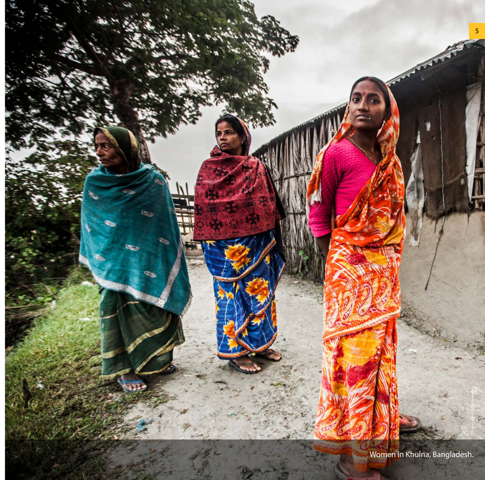
Women in Khulna, Bangladesh.

We invite you to join us in celebrating the success of these women.