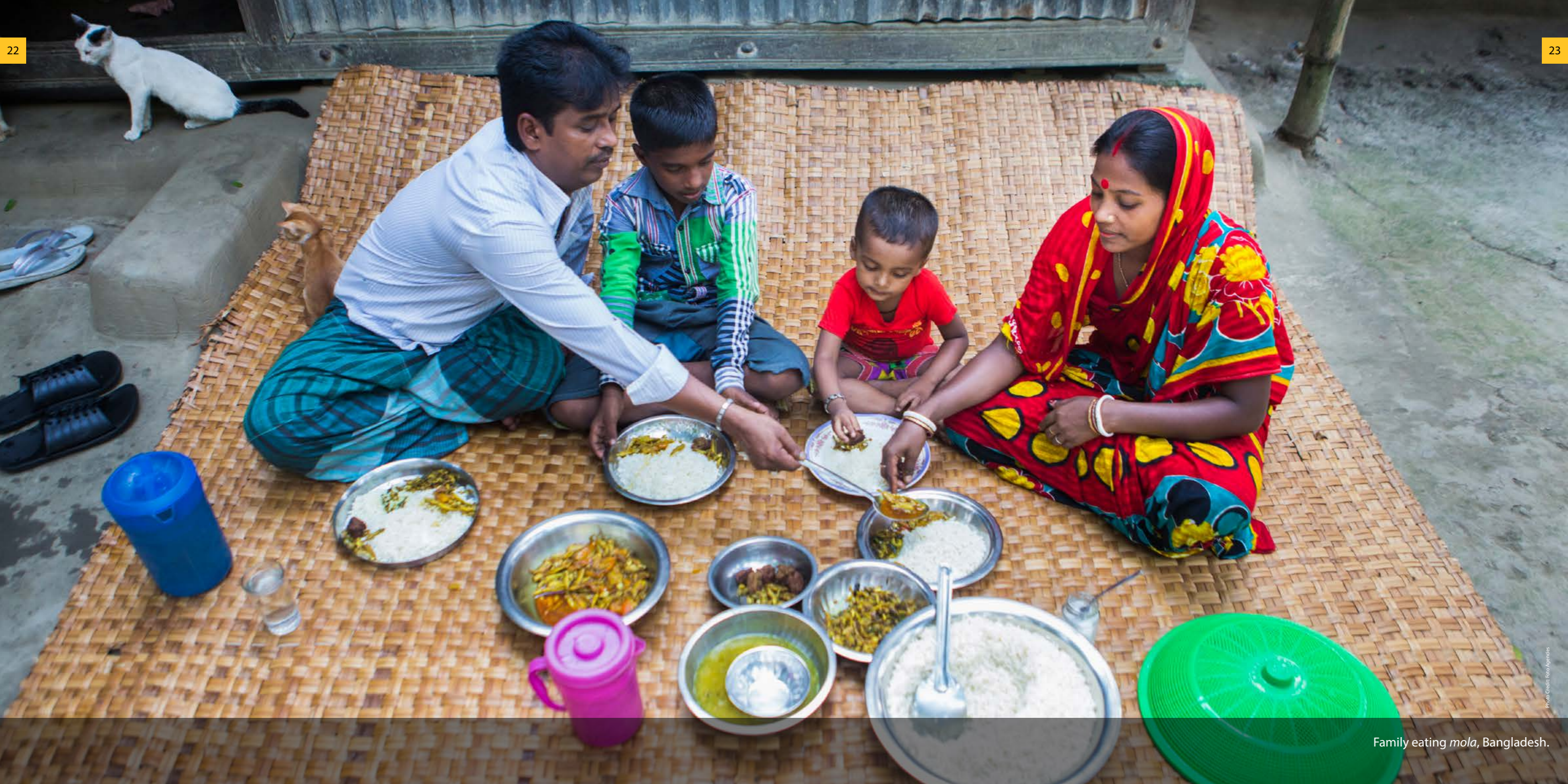
Family eating mola , Bangladesh.