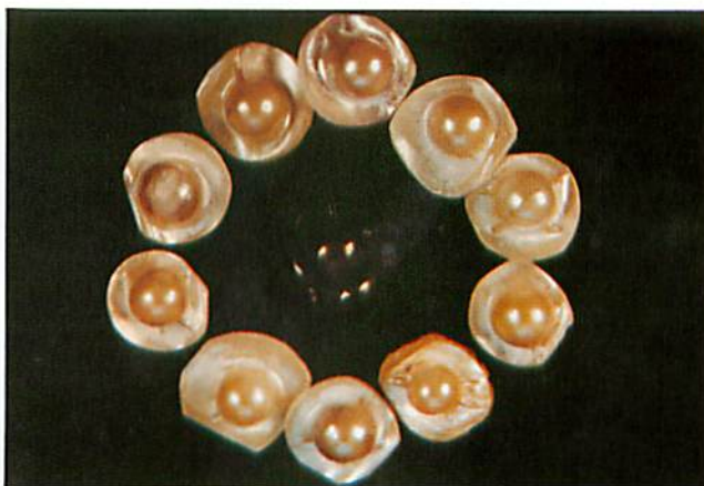
Half-round cultured pearls produced through mantle cavity insertion.

ity and functionality of the in vitro grown cells is being established. The in vitro cell culture studies have an application potential for ensuring a uniform quality of culture pearls produced 1 .