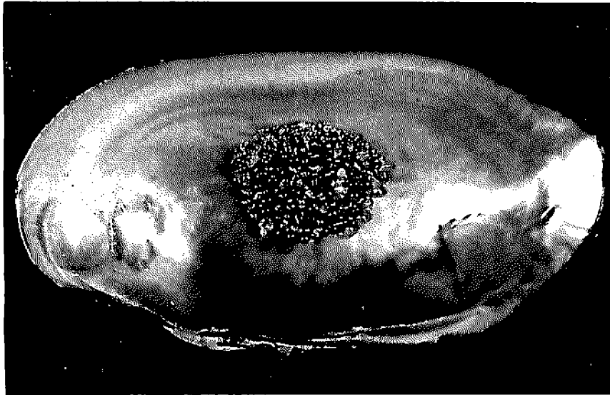
A collection of nucleated culture pearls in a shell produced through gonadal implantation.