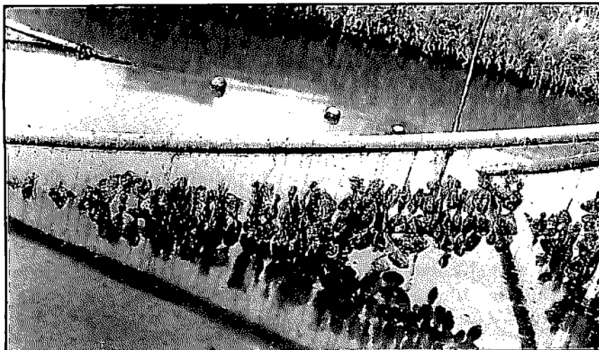
Implanted mussels in pond culture units.

pH : 7.5 to 8.5 Total alkalinity : 75 to 150 ppm Total hardness : 40 to 75 ppm Dissolved calcium: 25 to 50 ppm