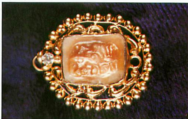
Designer cultured pearl produced through cavity insertion.