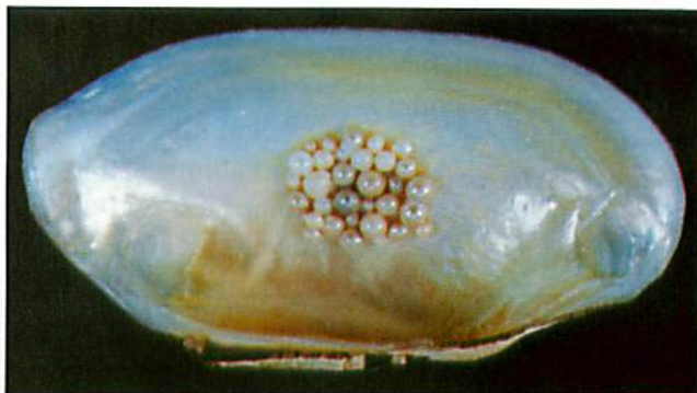
A collection of irregular non-nucleated culture pearls in a shell produced through mantle tissue implantation.