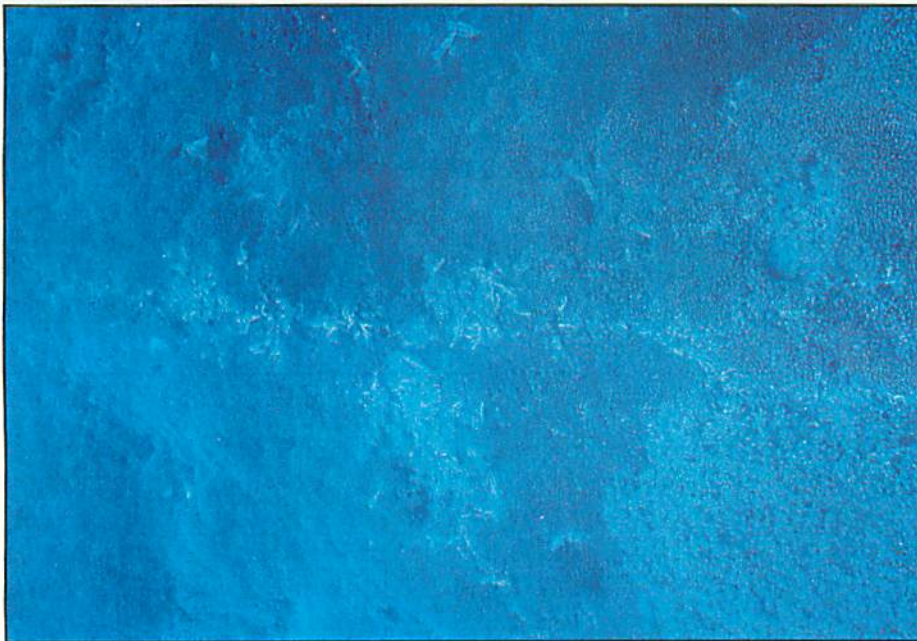
Anchor damage to Staghorn coral at south end of Tubbataha reef.