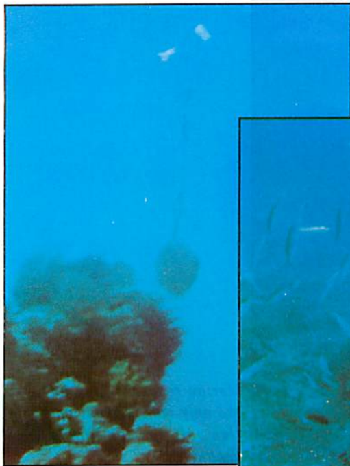
Muro-ami method of fishing, that of scaring fish out of coral reefs, has remained uncontrolled in Philippine fisheries.