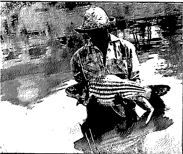
Four-year old Probarbus jullieni , weighing 8.25 kg, caught from the Mekong River.

production techniques, could help the aquaculture industry to develop at a greater speed in the region based on the indigenous species. Establishment of a network among the institutions/individuals interested to pursue the studies on the indigenous species might hasten the process.