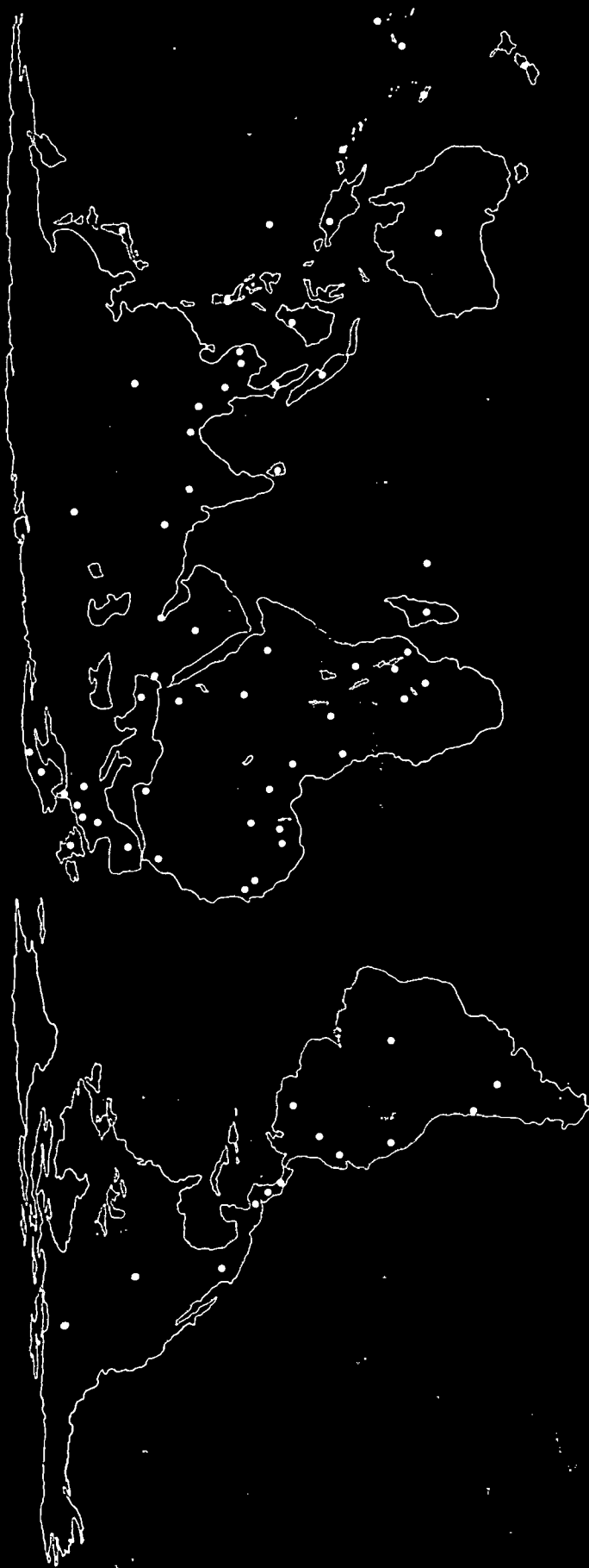
Worldwide distribution of members of the Network of Tropical Aquaculture Scientists