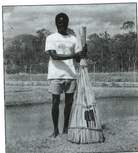
A cover pot or plunge basket displayed on the bank of one of the 200-m 2 experimental ponds at the Domasi Experimental Fish Farm, near Zomba, Malawi.

baited with common earthworms ( Lumbricus spp.). Two anglers fished. One hook with one line was fished by a single angler in a 200-m 2 pond between