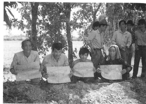
Farmers proudly display their drawings.

expenses can be reduced by about one-third. So a US$50/ha weeding bill becomes only US$33.40. NPK fertilizer application can be reduced by 28% from 209 to 192 kg/ha without reducing rice grain yield. Even if rice production falls because trenches take up 15% of the rice area the high value of prawn at 20,000 VN Dong/kg (about US$5) compared to rice (282 VN Dong/kg) still makes integration profitable. Incomes from prawns can be two or three times that of rice.