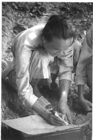
A farmer concentrating hard on his drawing.