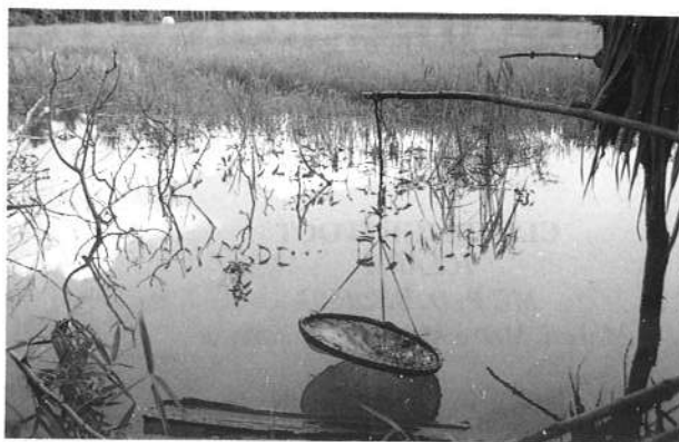
What a visitor to a Mekong Delta farm sees.