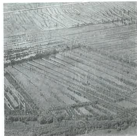
Traditional brackishwater fishponds ( tambak ) on the north coast of Java. In 1983 Indonesia had 242,308 ha of tambak producing 134,072 t of seafood valued at Rupiah 137,793 million or US$121 million.

The Timorese and Sumbanese have also carried out little traditional fishing activities due to their fear of the spirits in the sea as a final reserve of the dead. In contrast to them, other cultures in Indonesia, in particular the Mandarese, Makassarese, Butonese, Madurese, Buginese and Sanghinese islanders are famous for their long migrations and seafaring.