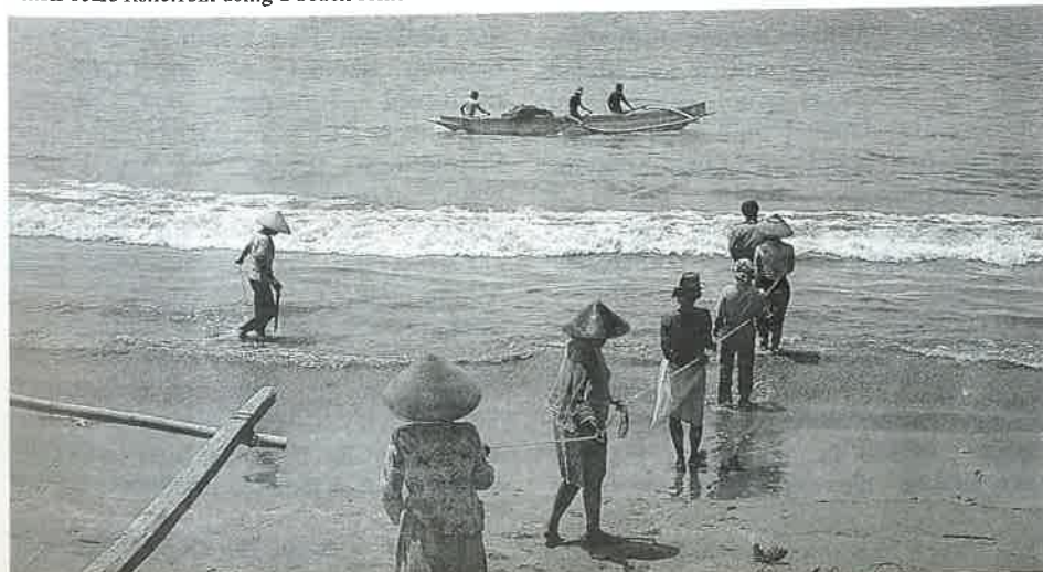
Small-scale fisherfolk using a beach seine on the south coast of Java.

The diversity of beliefs and strong geographic and cultural stratification (e.g., land and sea) in Indonesia can be appreciated through one example from the island of Sulawesi. Inland people of Sulawesi symbolically discard death, filth and diseases in rivers or the sea, while on the same island, on the southwestern peninsula, the Mandarese villagers seasonally carry out romantic and dangerous fishing journeys for their