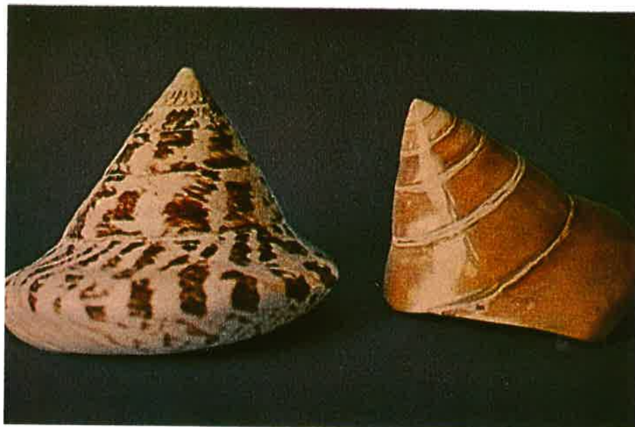
Trochus shells yield one of the thickest, most beautiful mother-of-pearls available on the world market.

A new size regulation for the trochus fishery was established in 1983; only shells with base diameter between 9 and 12 cm were permitted to be fished. Before 1983, only a lower size regulation of 8 cm occurred. The effect of this new regulation can be observed on Fig. 2, especially on the mean fishing mortality curve which, in that period, came close to the optimum value of 0.10. The mean biomass, which had been halved by the intensive exploitation that occurred in 1978, stabilized from 1981 around 2,000 t because of a considerable decline in actual catches. The sharp drop of fishing mortality since 1983 had a favorable effect on the biomass which showed an increase in 1984.