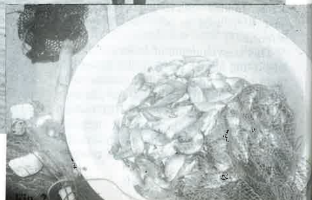
Fig. 1. Fishermen in Sakumo Lagoon, near Tema, Ghana. Fig. 2. A catch of tilapia ( Sarotherodon melanotheron ) from the lagoon.