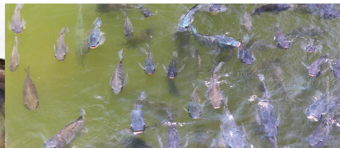
Fish gasping air at the surface