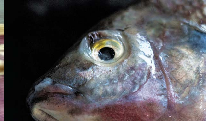
Eye endophthalmia/eye shrinkage