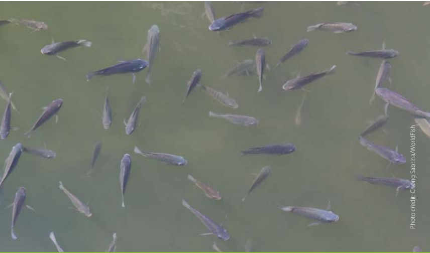
Fish lethargic at surface and not feeding

The purpose of this poster is to enhance the capacity of hatcheries, nurseries, grow-out farmers and extension service providers to recognize and report tilapia diseases. Prevention, early recognition, diagnosis and rapid intervention are the best steps to manage aquatic animal diseases. If you observe clinical signs, abnormal behaviour and unusual mortality, contact your local aquaculture health professionals to report and ask for support.