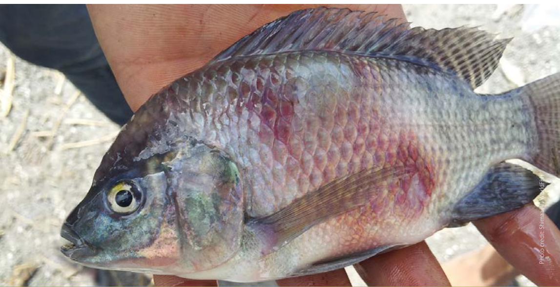
Skin erosions hemorrhagic lesion