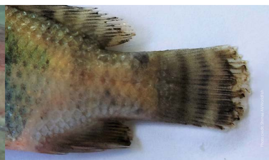
Fin rot/tail rot