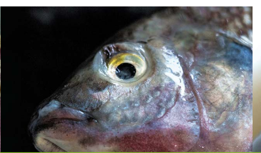
Eye endopthalmia/eye shrinkage