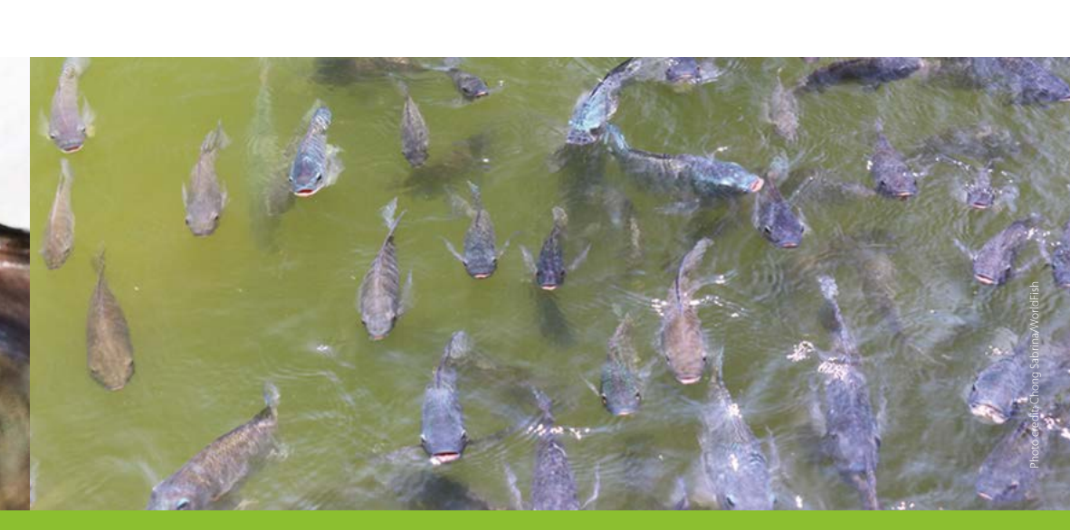
Fish gasping air at the surface