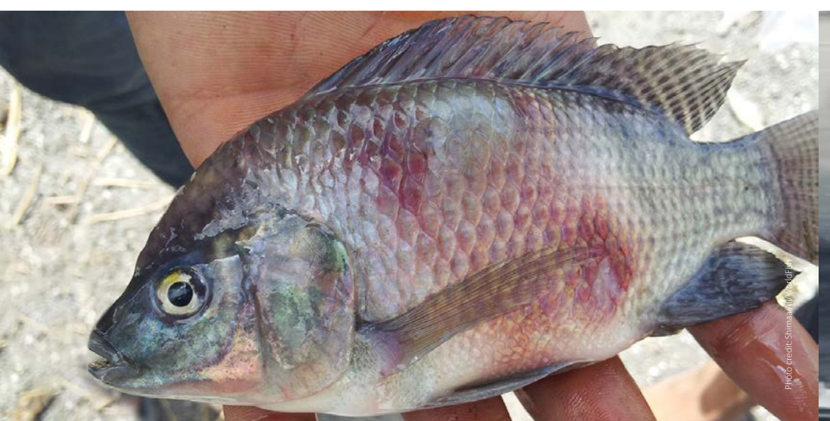
Skin erosions hemorrhagic lesion