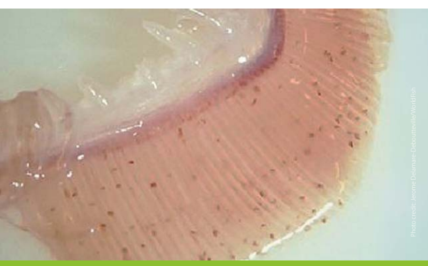
Gill paleness (anemia)