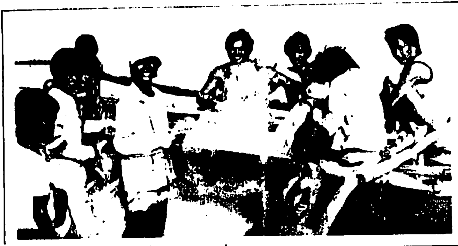
The smiles tell it all—the night's catch was good.

among relevant socioeconomic indicators found that desire for occupational change is highest in those fishing villages characterized by lower income levels ( r = .70^* ), by lower percentage of boat ownership ( r = .70^* ), by lower levels of fishing effort ( r = .74^* ), and by younger fishermen ( r = .82^* ). Importantly, desire for occupational change was highest in those communities with the highest percentage of households dependent upon fishing ( r = .75^* ).