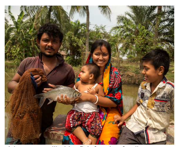
A happy smallholder fish farming family

The Bangladesh Aquaculture and Nutrition Activity takes a market systems approach where the emphasis is on facilitation rather than direct implementation. Activity staff will identify critical