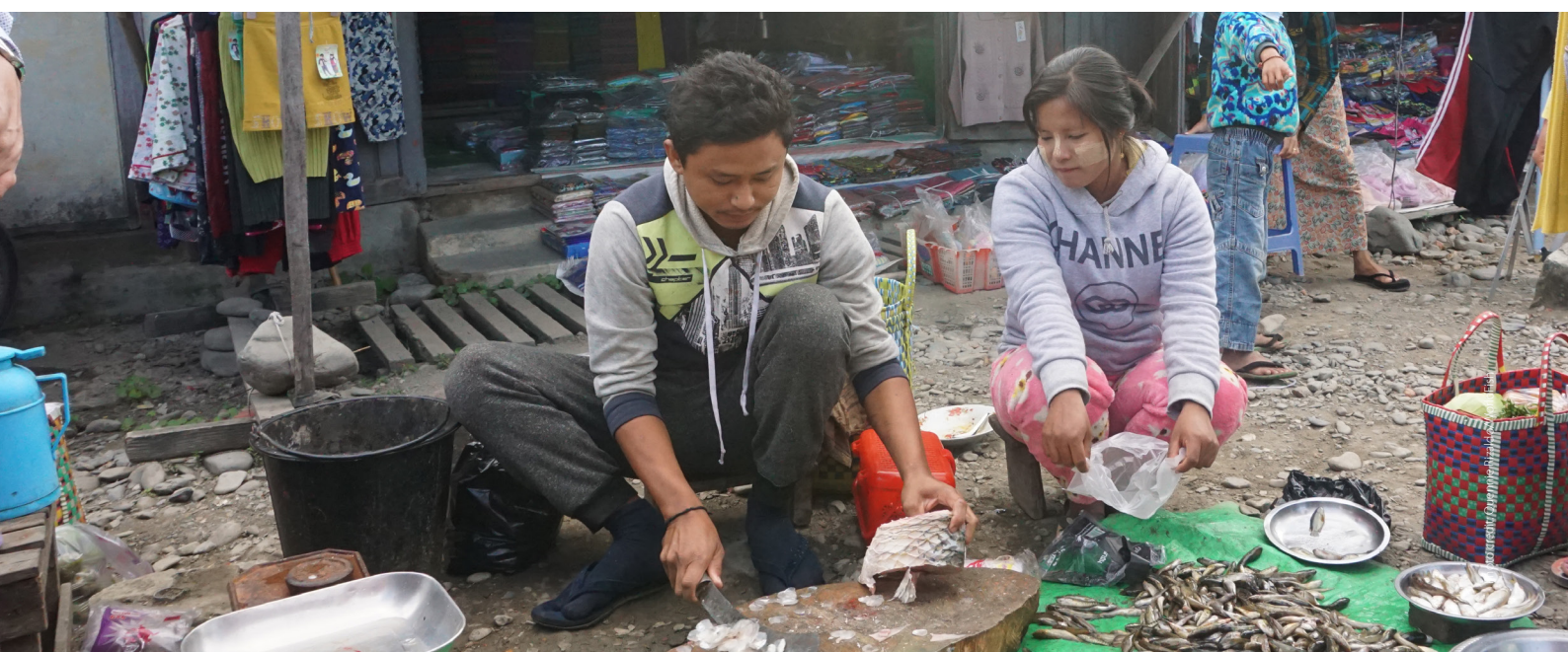
A man and a woman together selling fish in the Kale market, Sagaing region.

The aim is to increase visibility and reinforce the value of fish in improving nutrition, as well as to provide information among stakeholders on the nutrition-sensitive fish agri-food systems approaches implemented by WorldFish. Moreover, by participating in nutrition and health discussions (such as the SUN Civil Society Alliance, and the Technical Working Group), fish will be put on the agenda at the policy level, benefiting many rural communities that are heavily reliant on fish as the primary animal-source food in their diets (Youn et al. 2018).