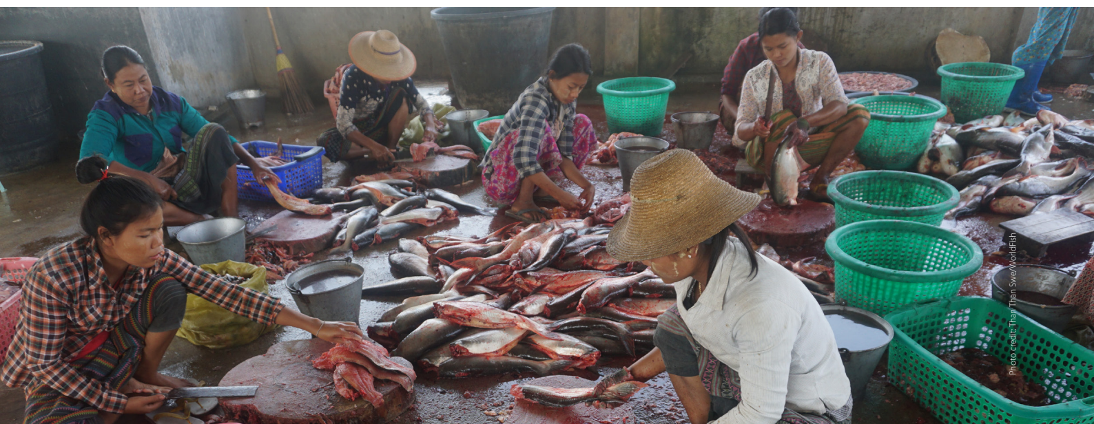
Women involved in postharvest activities in a fish farm in Madaya, Mandalay.

The project is aligned to the country's commitment to combating malnutrition as reflected in the government's Multi-Sectoral National Plan of Action for Nutrition (MS-NPAN). 1 The MS-NPAN reinforces the need for all actors from relevant ministries, nongovernmental organizations (NGOs) and the private sector to work together, as well as with the Myanmar Agricultural Development Strategy (ADS), 2 to find solutions.