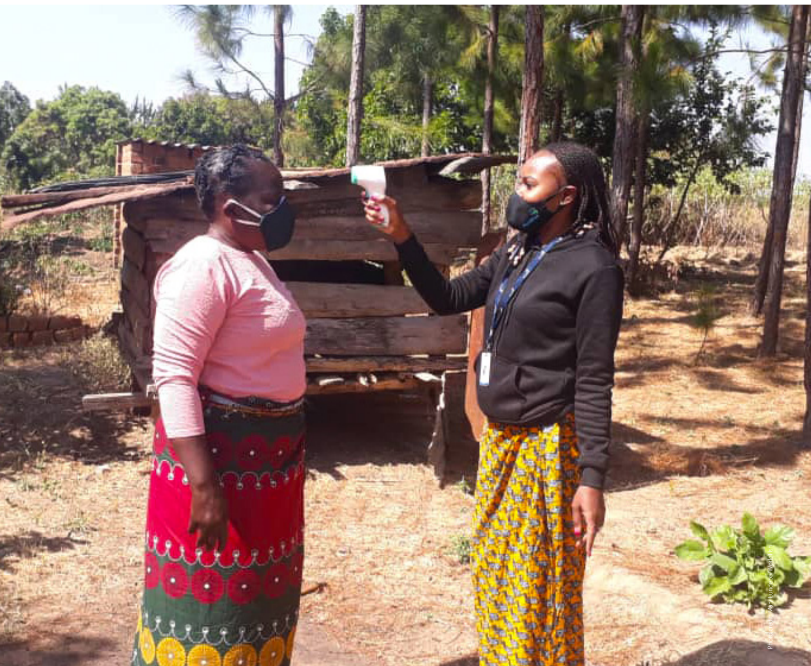
Smallholder farmer (in pink top) undergoing COVID-19 health guidelines before aquaculture training with WorldFish in Mbala District, Northern Province, Zambia.

All suggestions for insights from use and suggestions for future versions of this resource are very welcome. Please contact Cynthia McDougall at c.mcdougall@cgiar.org .