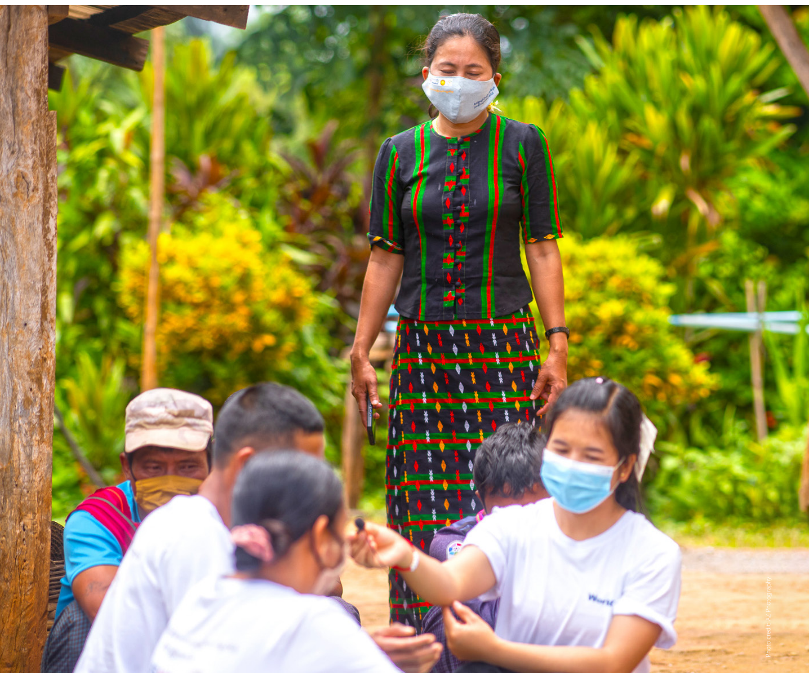
Keeping covered while describing a new dish prepared as a part of nutrition month celebration in Taunggyi, Southern Shan, Myanmar.