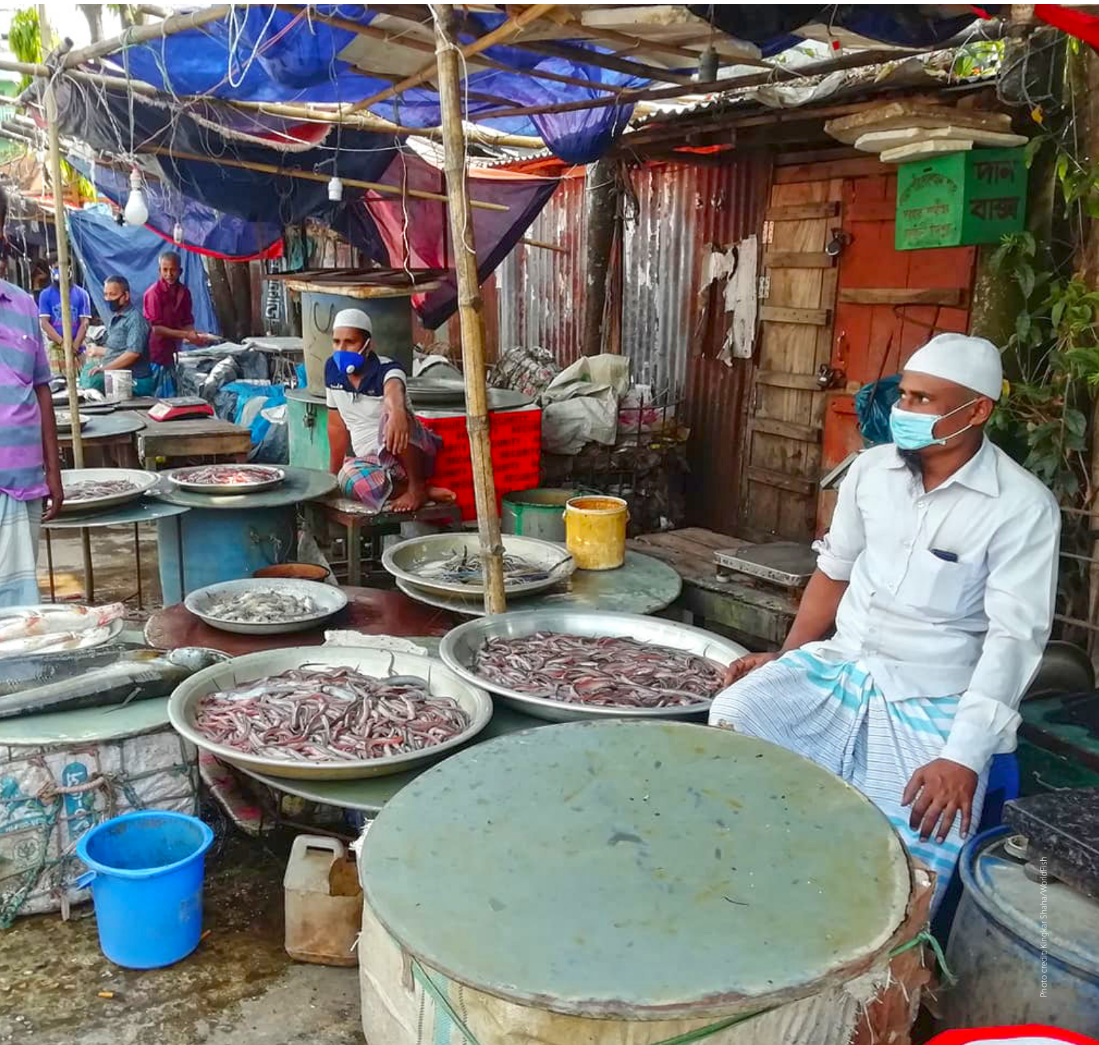
Reduced availability of fish and other foods in markets during the COVID-19 pandemic has implications for nutrition and livelihoods in Chandpur, Bangladesh.

Many organizations are developing research projects to track impacts and responses to COVID-19. Although not all of these projects are compatible, many have areas of overlap. Coordinating research can prevent unnecessary duplication of research efforts, reduce participant and community disruption and increase data standardization and comparability across projects and sites.