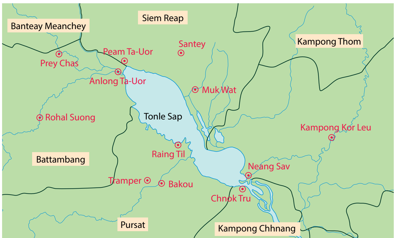
Figure 1. AAS community visioning: Locations of the 12 selected villages.