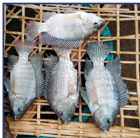
GIFT tilapia harvested from the pilot rice-fish plot in Kengtung

With MYSAP support U Sai Sum Tip's 0.6 ha (1.5 acre) pilot rice-fish plot, Mikesili, Koon Village, Kengtung Township in one year yielded 4,400 kg (135 baskets) of rice, being 2,320 kg (71.17 baskets) of irrigated summer SR456 rice and 2,080 kg (63.8 baskets) of monsoon RO428 rice without the use of any pesticides which is beneficial for the environment and a total of 689.5 kg (423 viss) of fish being 546 kg (335 viss) of tilapia, 86.5 kg (53 viss) of common carp and 57 kg (35 viss) of wild snakehead, catfish and SIS.