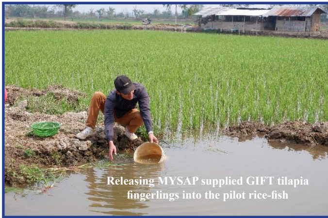
Releasing MYSAP supplied GIFT tilapia fingerlings into the pilot rice-fish

The Myanmar Sustainable Aquaculture Programme (MYSAP) is funded by the European Union (EU) and the German Federal Ministry for Economic Cooperation and Development (BMZ) and is implemented by Deutsche Gesellschaft für Internationale Zusammenarbeit (GIZ) GmbH and the Department of Fisheries. WorldFish Myanmar is realizing the MYSAP Inland component under a GIZ grant agreement. Field activities are conducted in collaboration with Ar Yone Oo, BRAC Myanmar and Malteser International as sub-contracted implementing partners.