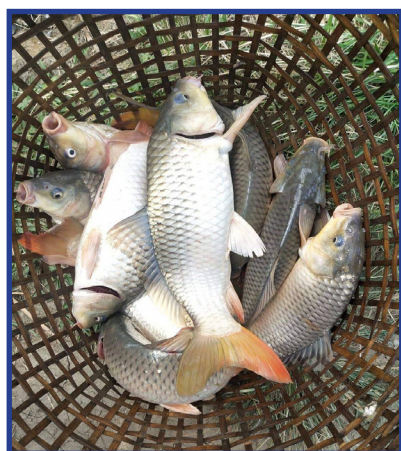
Common carp harvested from the pilot rice-fish plot in Kengtung

At the final fish harvest after one year of culture, the GIFT tilapia and the common carp were an average of 310 g and 1,371 g respectively, with survival being 77% and 79% for the GIFT tilapia and common carp respectively over the 1 year culture period.