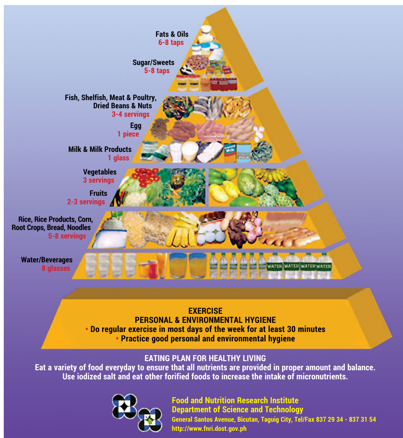
Figure 1. Philippines FBDG

Across all of the FBDG reviewed, graphic representations typically included a whole fish. Specific fish species were more commonly depicted in graphic representations by region, such as salmon in North America and Europe, and pelagic small fish species in sub-Saharan Africa, South and Southeast Asia. The FBDG of Thailand and Sri Lanka illustrated the greatest variety of aquatic foods in graphic form, perhaps, due to the great diversity of aquatic foods common in diets and production systems in these countries. However, Japan's FBDG pictured just one aquatic food, even though the Japanese diet is well-known for its diversity of aquatic foods.