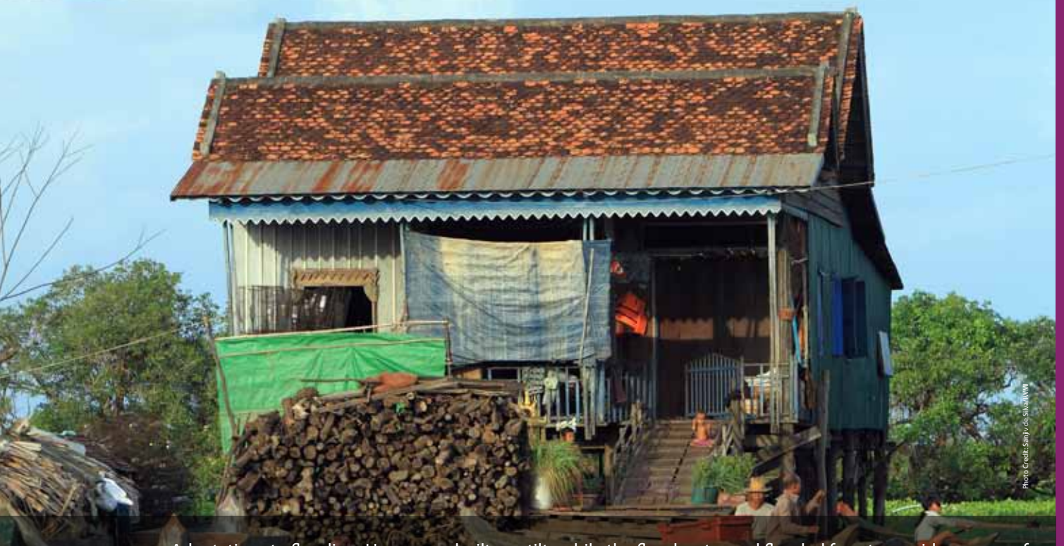
Adaptations to flooding: Houses are built on stilts while the flood water and flooded forests provide a range of ecosystem services such as fish and fuel wood, Muk Wat village.

irrigation fee that acknowledged distance to the water source and cost of pumping. In other communities, when conflict occurred between water users and no community-based organization operated locally, the intervention of local authorities was necessary.