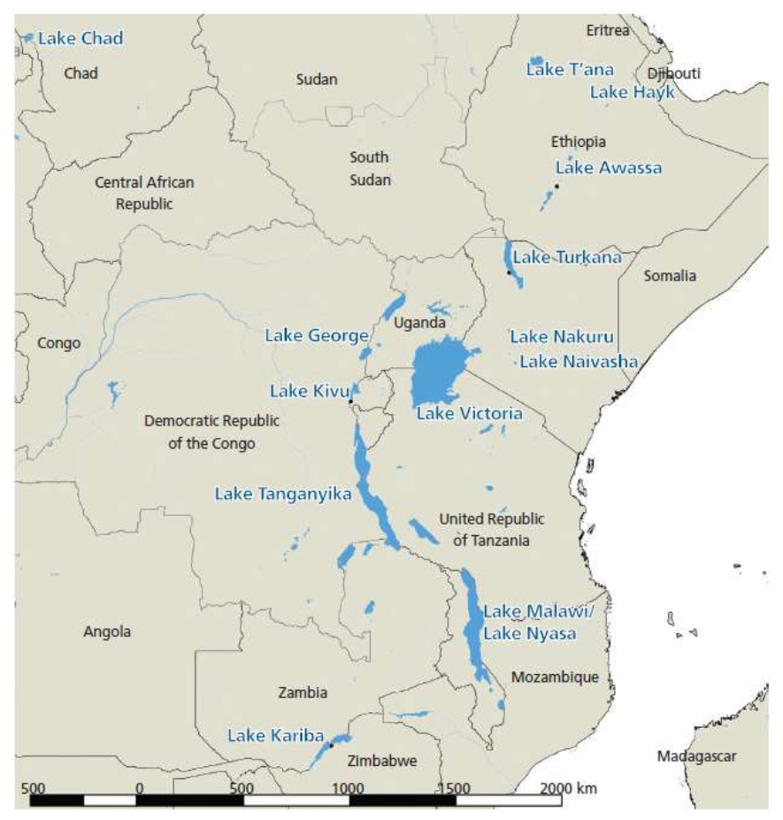
Figure 1 Map of the AGLR and the seven major lake basins, as well as coastlines.

Africa's Great Lakes Region covers an area of more than 850,000 km<sup>2</sup> of vast lakes, rivers and wetlands that comprise approximately 25% of the earth's unfrozen freshwater surface area. There is no universally defined boundary for the African Great Lakes region, however the region comprises seven major lake basins: Albert, Edward, Kivu, Malawi, Tanganyika, Turkana and Victoria, and rivers: Congo, Zambezi and tributaries to the Nile, which flow to the Mediterranean Sea and Indian Ocean (Cowx & Ogutu-Owhayo, 2019). Hundreds of smaller lakes, wetlands and intermittent water bodies are also found across the region. The AGLR covers 10 countries ( Figure 1 ): Burundi, Democratic Republic of Congo, Kenya, Malawi, Mozambique, Rwanda, South Sudan, Republic of Tanzania, Uganda and Zambia (Cowx & Ogutu-Owhayo, 2019). Over 287 million people live around the African Great Lakes (Lowe-McConnell 2003); and most of these people rely on fisheries, particularly for smallpelagic species, their food and nutrition security as well as livelihoods ( Tables 1 & 2 ).