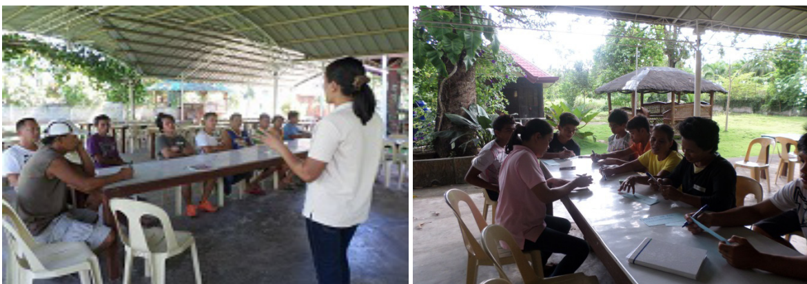
FGD session conducted by Field Research Assistant

Our FGDs were framed with two major objectives. One is to unpack the issues affecting small-scale fishermen and the communities that depend on them; and, to identify potential interventions to address their issues and concerns that eventually enable them realize their dreams. These results guided us in the conduct of consultative workshop which was held on June 30, 2014 in People’s Palace, Balingasag, Misamis Oriental. The Consultative Workshop was founded on the use