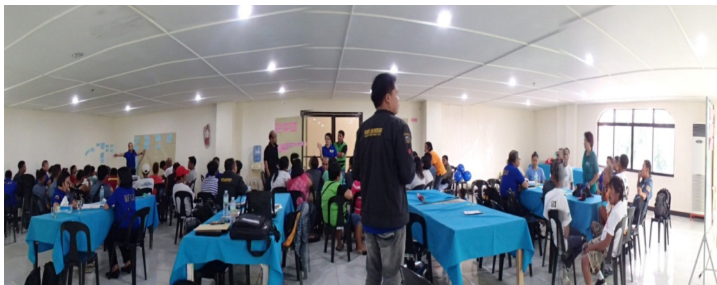
Photo taken during the Consultative Workshop on 30 June 2014