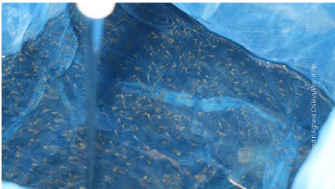
Plate 10. Day-old swim-up fry placed in a nursing hapa.

In preparation for tagging, fry were reared in hapas in ponds until they reached 5 g.