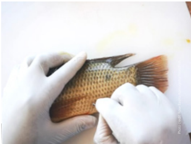
Plate 6. Inserting a PIT.