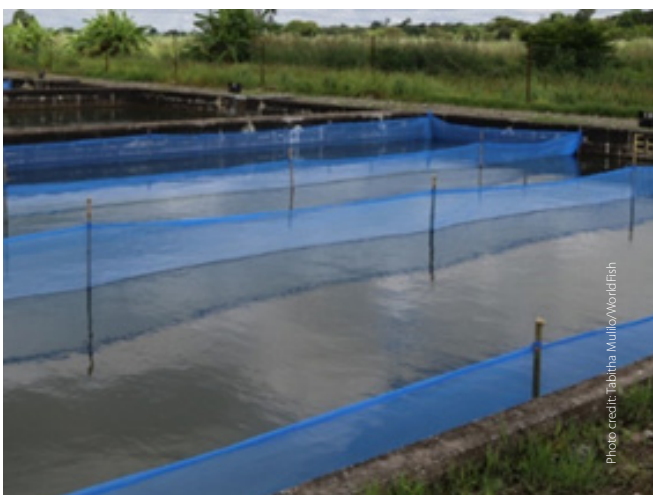
Plate 4. Conditioning hapas at the NARDC.