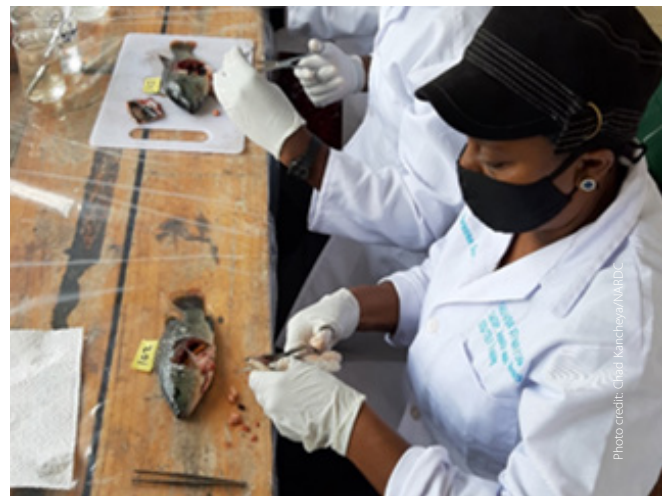
Plate 3. Tissue sampling for laboratory analysis.