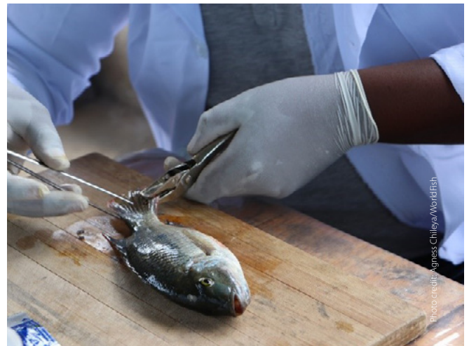
Plate 7. Fin clipping.