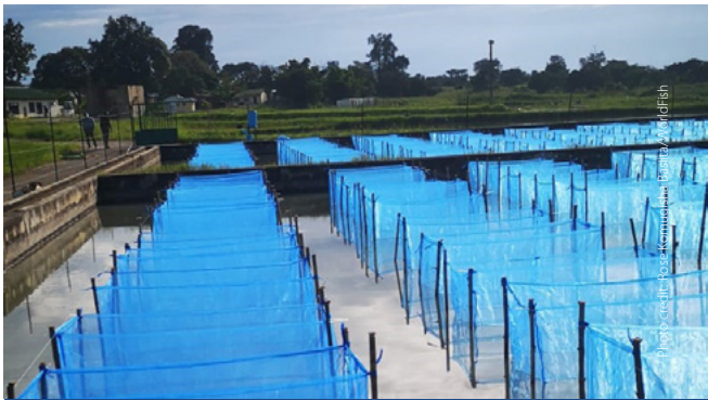
Plate 8. Hapas in ponds used for mating at the NARDC.

These families were produced and incubated in the GIP hatchery at the NARDC (Plate 9).