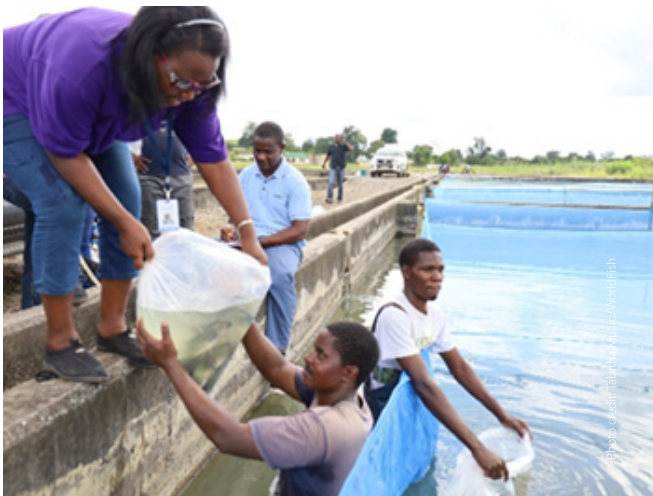
Plate 2. Stocking broodstock in conditioning hapas at the NARDC Mwekera in Kitwe.