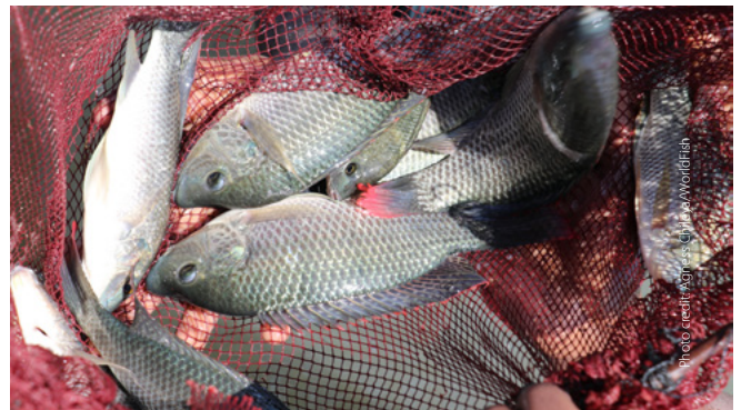
Plate 11. A sample of F1 (G0) three-spotted tilapia harvested from GIP grow-out ponds at the NARDC.

Finally, through various stakeholder meeting engagements, the following strategic reports have been produced under the project: