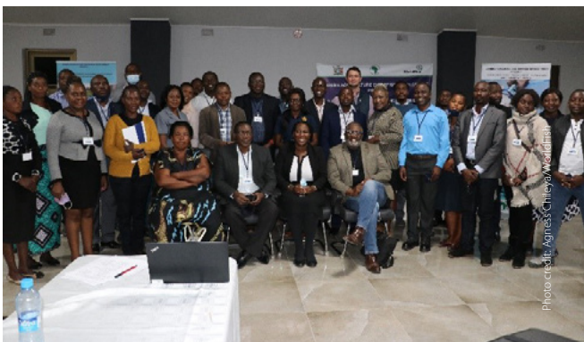
Plate 12. A multistakeholder consultative meeting on the development of the Nile tilapia strategy.