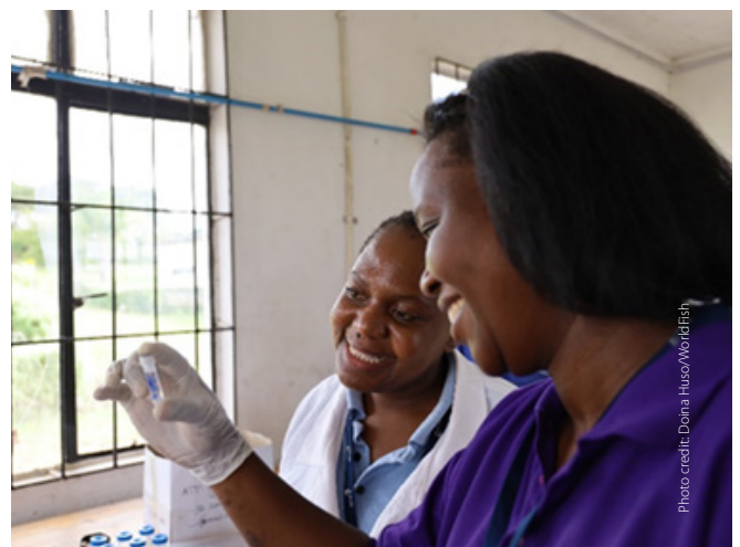
Plate 5. A cryo-vial with a fin clip for DNA extraction.