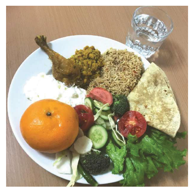
Plate 1 . A visual representation of a balanced meal in Pakistan (FAO, 2018)