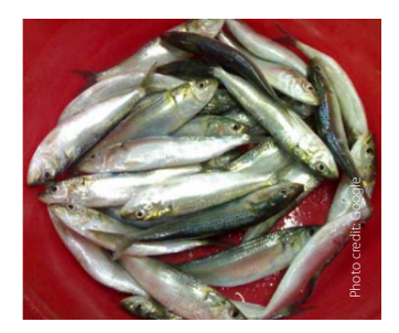
Plate 3 . Sardines is a good source of micronutrients and essential fatty acids.