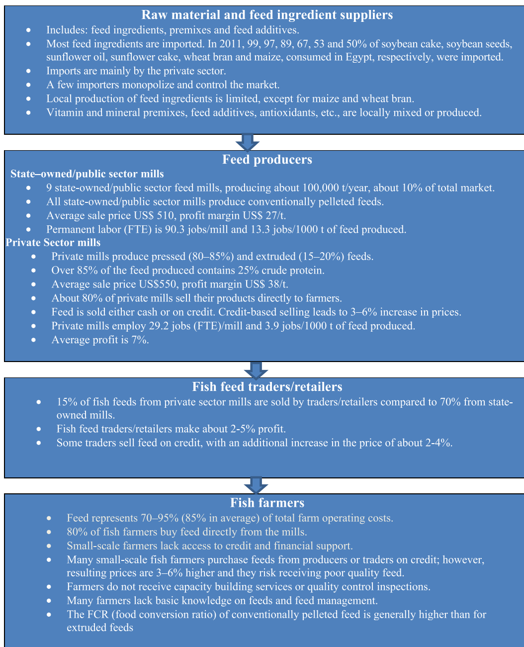
Fig. 1. The Egyptian aquaculture feed value chain.