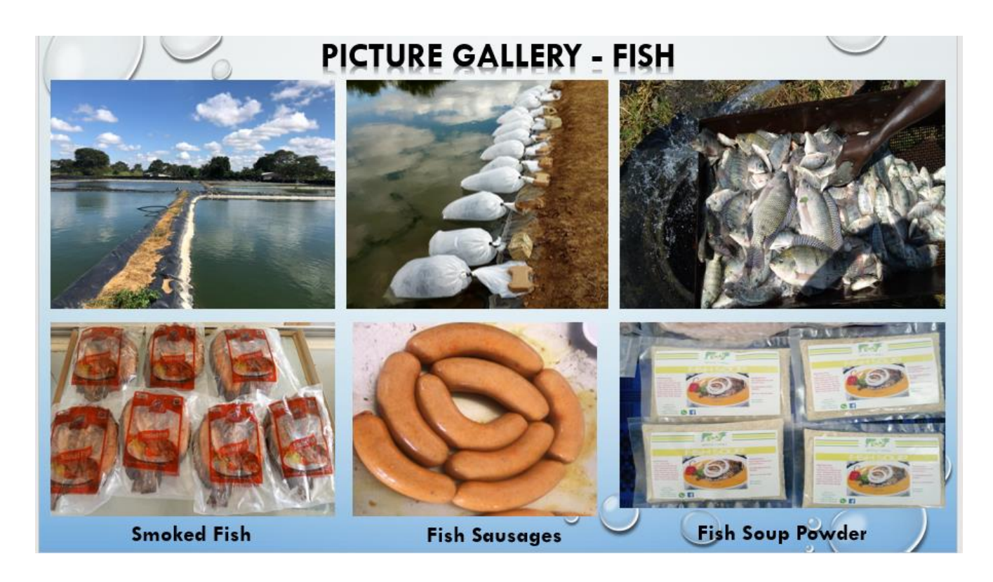
Figure 3: Assorted fish products from farm; an extract from Mpeni farm presentation