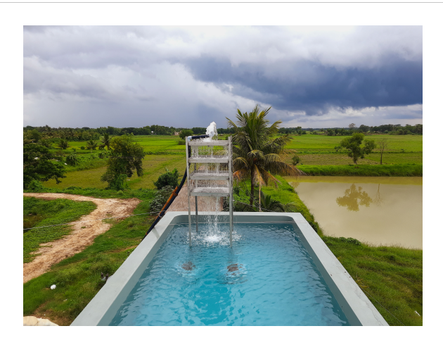
FIGURE 2 Aeration tower installed in the overhead water reservoir tank.

among the five treatments, and these doses were selected for the mass production of mola seed.