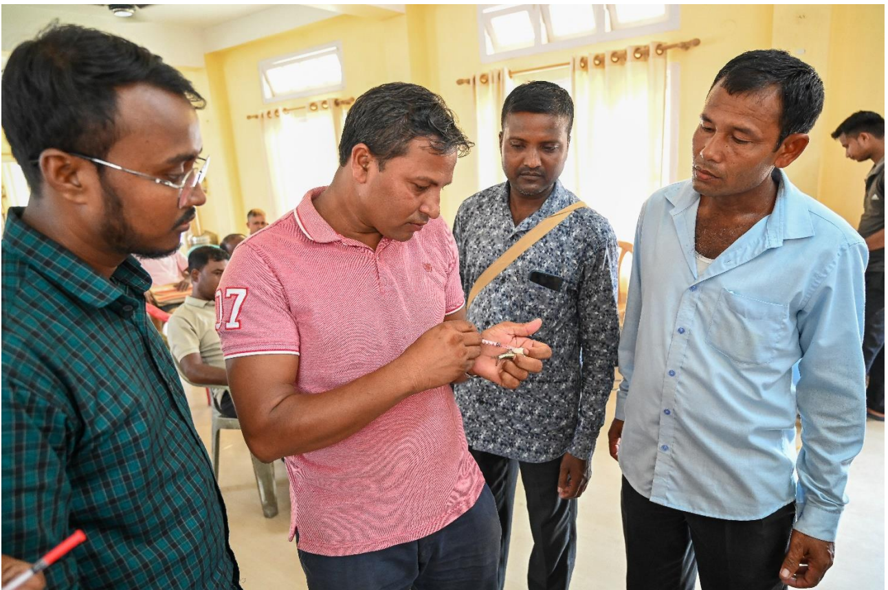
Hormone injection hands-on experience by the participants.