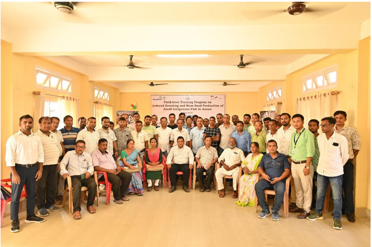
Participants in the second batch of farmer training program.