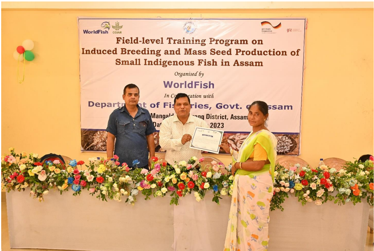
Training completion certificate distribution to the participants by DFDO.