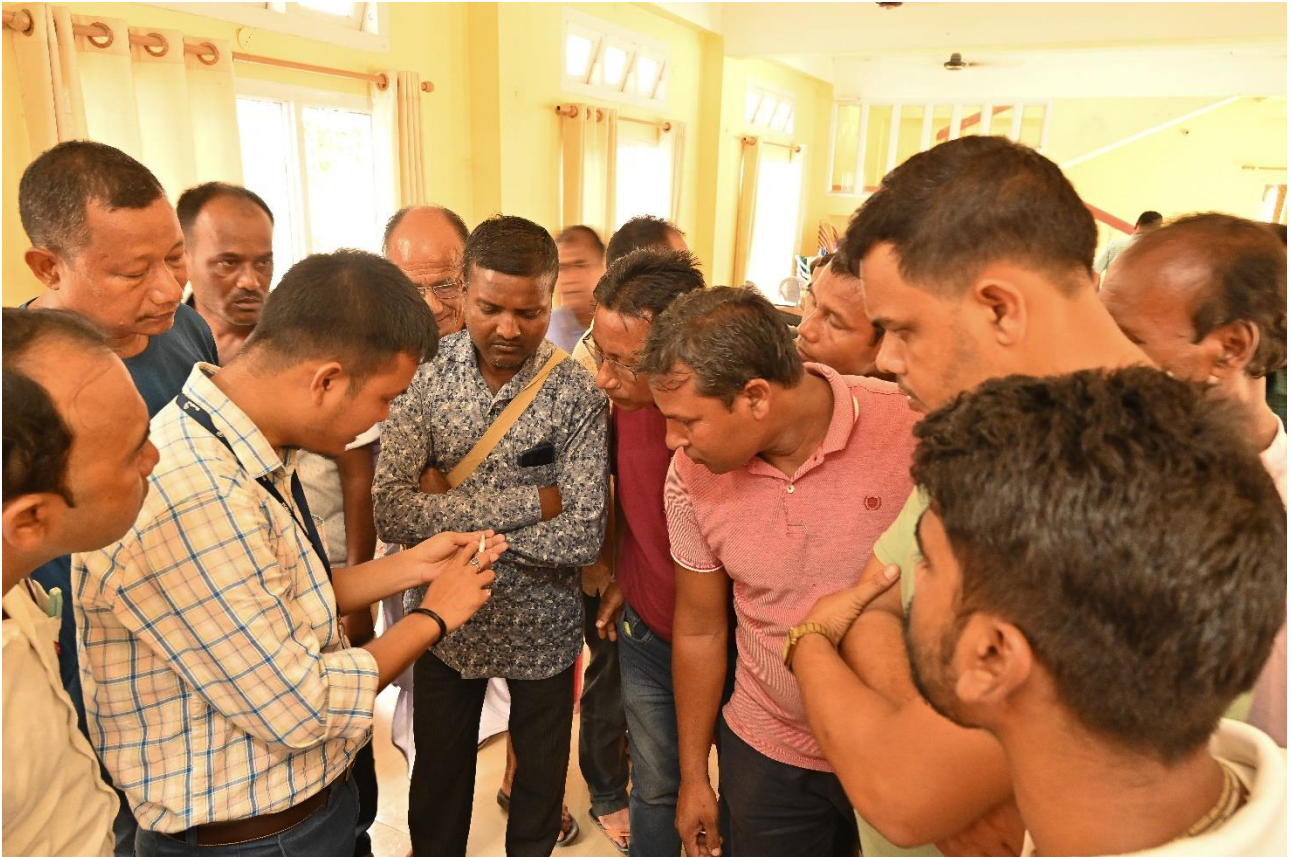
Practical demonstration of hormone injection.