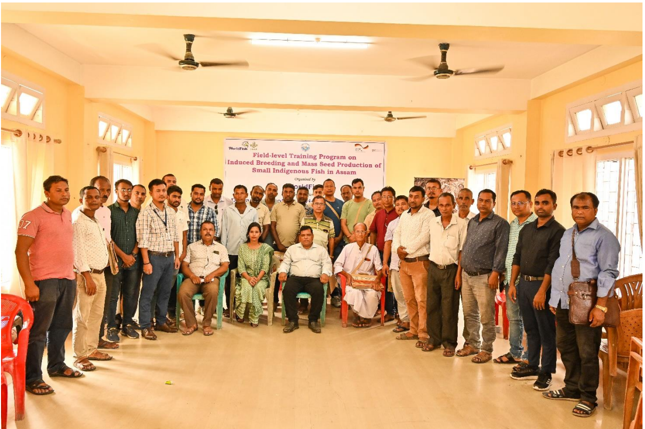
Participants in the first batch of farmer training program.