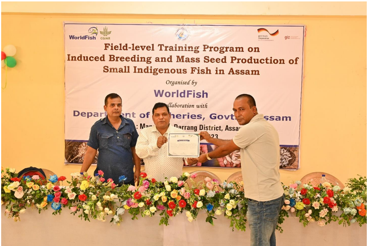
Training completion certificate distribution to the participants by DFDO.