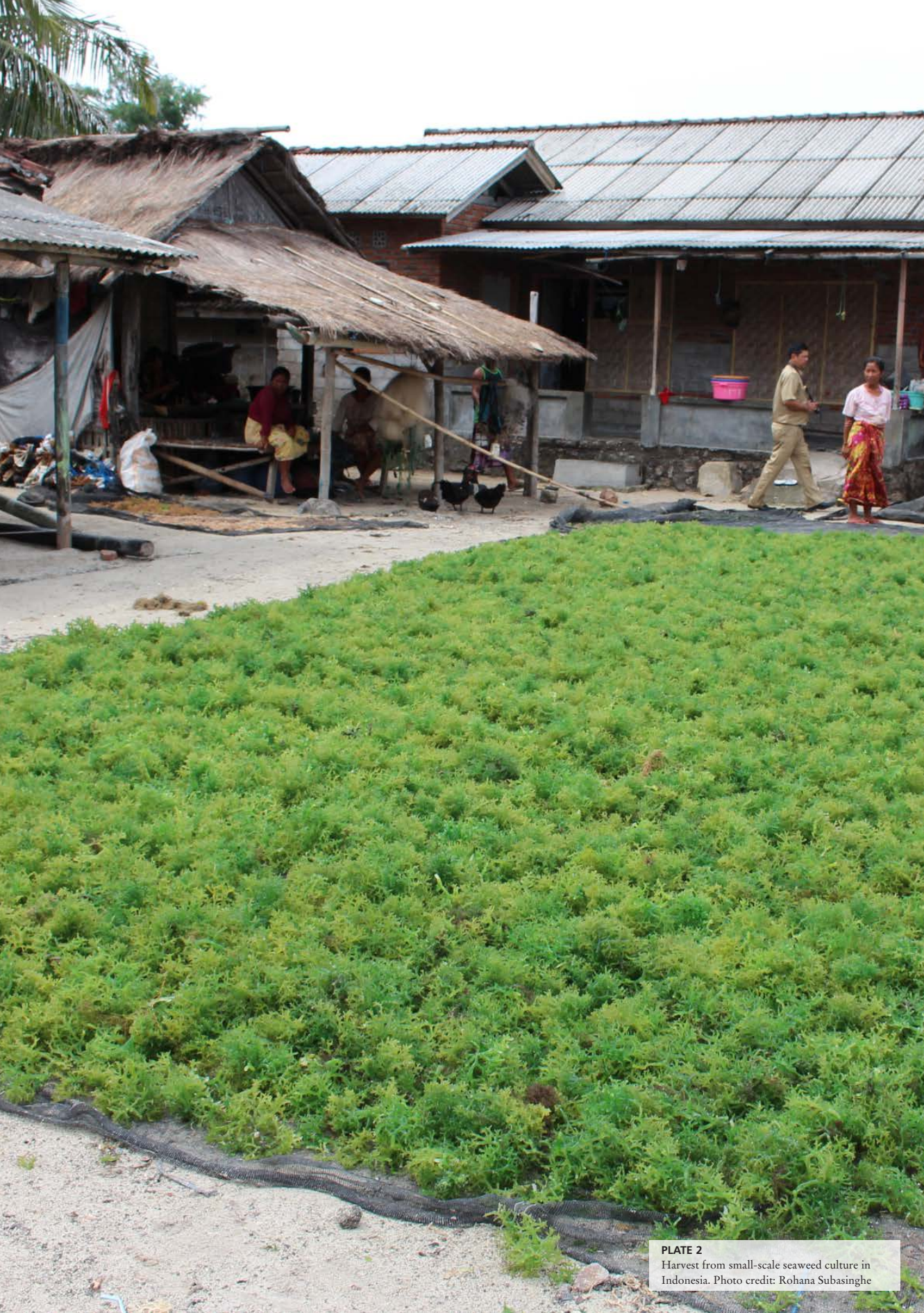
PLATE 2 Harvest from small-scale seaweed culture in Indonesia.