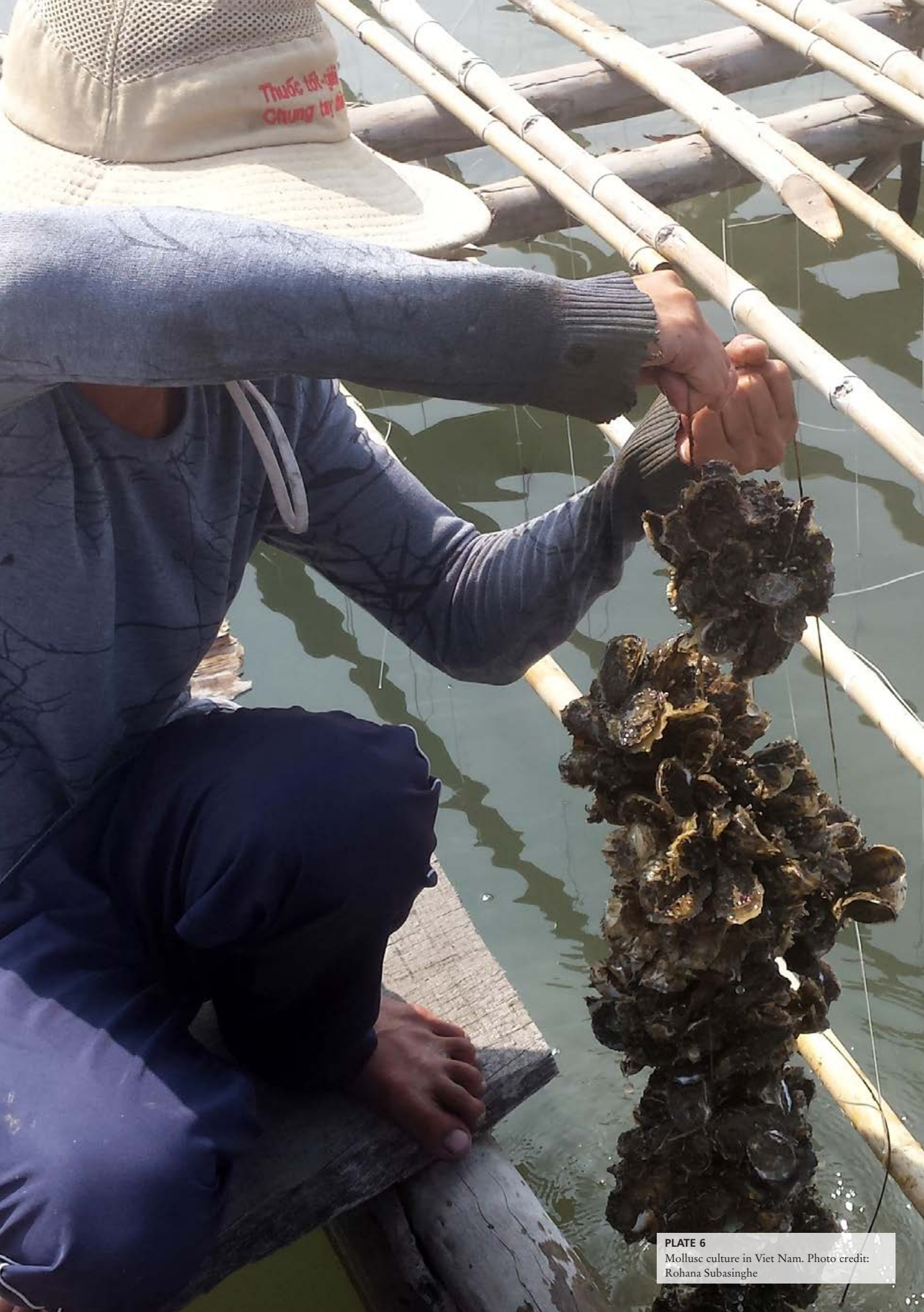
PLATE 6 Mollusc culture in Viet Nam.