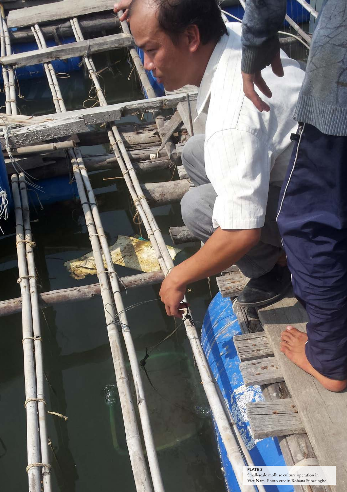
PLATE 3 Small-scale mollusc culture operation in Viet Nam.