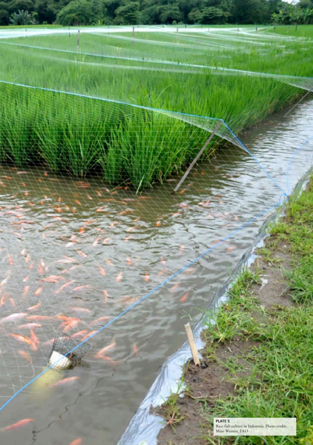
PLATE 5 Rice-fish culture in Indonesia.