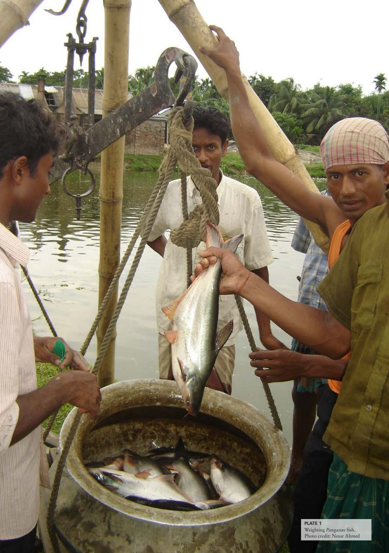
PLATE 1 Weighting Pangasius fish.